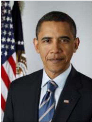
Barack Obama President of the United States