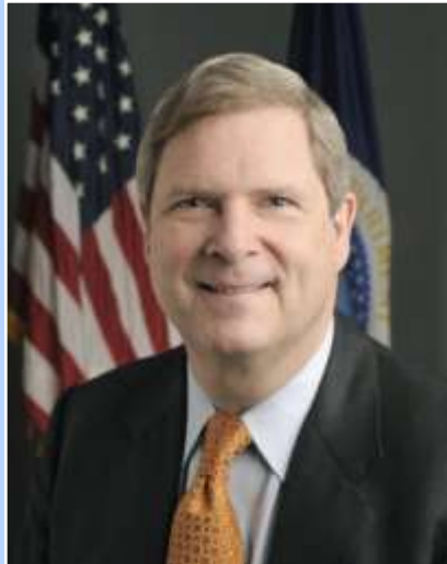
Tom Vilsack Secretary of Agriculture