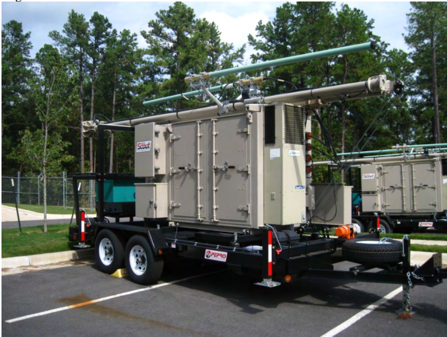
Figure 1. Site on Wheels

For this project, the state proposes to procure a “site on wheels,” purchase a cache of 40-50 spare radios, and develop a team that will be trained to deploy and manage the equipment. This equipment would be used not only to restore communications at sites that are unavailable, but would also augment communications during emergencies, or large events. This equipment will be available to public safety organizations statewide. ADEM asserts investment 4 is on schedule to be completed by September 30, 2010.