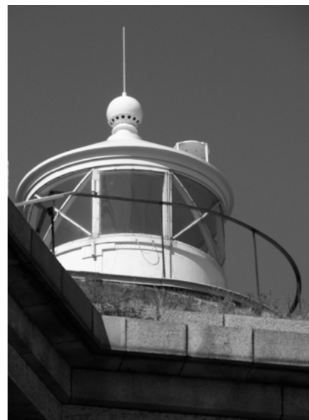
Fort Wadsworth is featured in 2 of the podcasts, available for download.

Gateway National Recreation Area has it all! The park hosts beaches, bike and hiking trails, historic forts, nearly 350 species of birds and even hungry goats. This series of video podcasts helps you explore what the park offers at Sandy Hook, Jamaica Bay and on Staten Island. Find out how volunteer "citizen scientists" help us monitor natural species and what Gateway is doing now to save Jamaica Bay's salt marshes from the dangers of climate change.