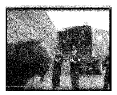
{\it Troops encircling the demonstrators}.