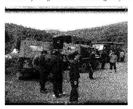
Troops readying to move in, with batons and electric rods in hand.