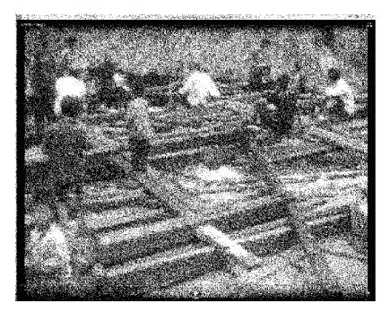
What's left of the Hmong villagers' homes.

The villagers decided to demonstrate against the demolition of their homes. Words got out to Hmong communities in other provinces, who were also targeted by the government's policy of persecution against Hmong Christians. On May 1, 2011 thousands, including men, women and children, gathered in a location near Huoi Khon Village in Muong Nhe District, some coming from as far as Dak Lak and Binh Phuoc in the South. On May 2, the local government and police arrived and asked for the reasons of the demonstrations. The demonstrators explained that they wanted to petition for the freedom to practice their faith and a stop to the confiscation of their farm land and their homes. The authorities told the demonstrators that their petitions would be duly considered and would be communicated directly to each petitioner. For that purpose, the authorities asked for the ID paper of each demonstrator. Sometimes they kept the original documents and some other times they took pictures and returned the originals.