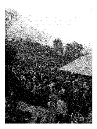
Thousands\ of\ Hmong\ demonstrators\ demanding\ end\ of\ land\ confiscation\ and\ religious\ persecution.