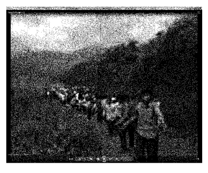
Demonstrators, including women and children, trying to escape the brutal assault by the mobile police and military.

The government arrested many demonstrators and took them into custody. Those who escaped arrest were tracked down in the following months by the police who now have their residential address. Reportedly hundreds of demonstrators hid themselves in the jungle. Many have since been captured while a number successfully made it to Thailand after months of trekking through Laos.