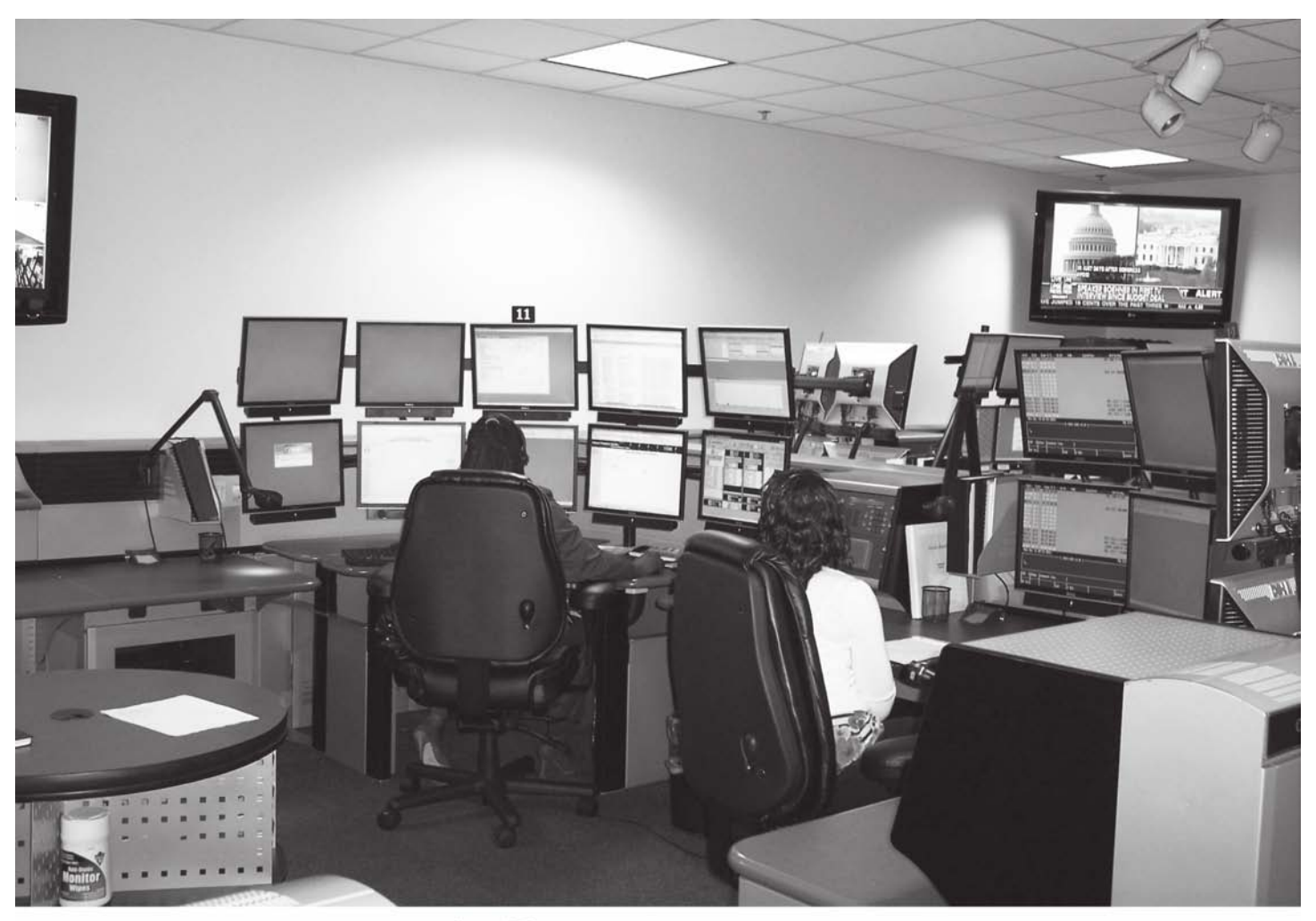
Figure 1: Federal Protective Service MegaCenter, Suitland, Maryland