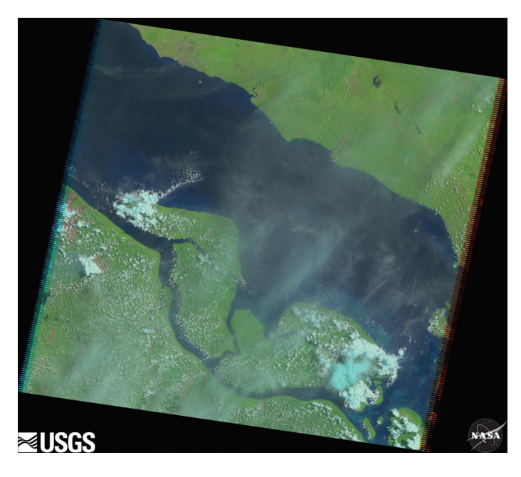
Malaysia is often cloud covered, so obtaining cloud-free satellite imagery is difficult. However, with the use of Data Rescue funds, the

The Landsat Mission has been acquiring images from around the world since 1972. In the past four decades, data have been downlinked to satellite ground stations across the globe. The USGS estimates that over 5 million images reside in international archives, and there is a major effort underway to bring all these data back to the USGS. In response to this endeavor, the USGS has received over 500,000 images in the last 2 years from its international partners. These digital files come in all types of formats and on all types of media. Funding for software development and archive storage has come from the Data Rescue Program.