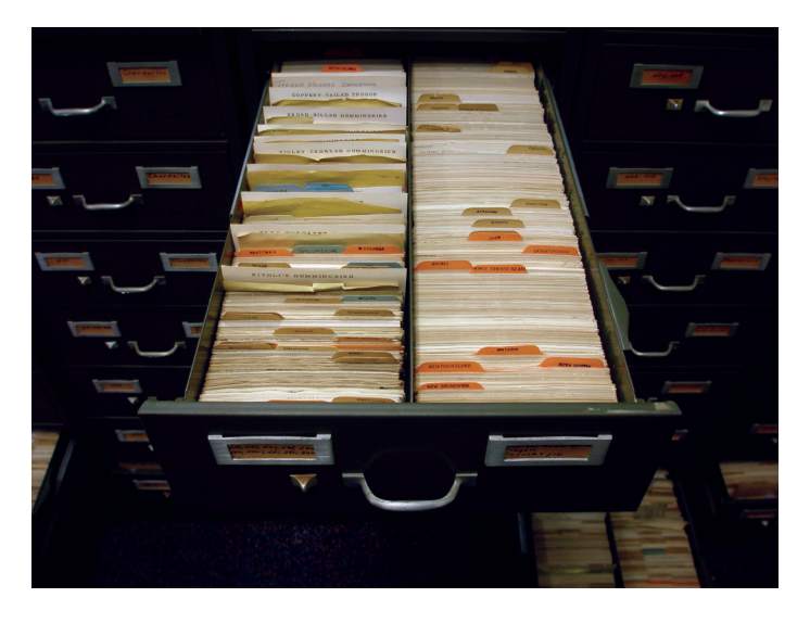
Original historical bird migration records.

With the assistance of Data Rescue funding, more than a million original historical bird migration records documenting arrival and departure dates for over 870 species across North America were electronically scanned. In an innovative project to curate the data and make them publicly available, the scanned records were uploaded to the Internet, where volunteers worldwide transcribed the records and added them to a database for analysis. This dataset is unique in its coverage, temporal breadth, comprehensiveness, and comparative value to modern measures of climate change. Its rescue, digitization, and distribution provide unprecedented insight into bird migratory behaviors, including their responses to climate change. For more information, see the Web site for the North American Bird Phenology Program at <a href="http://www.pwrc.usgs.gov/bpp/">http://www.pwrc.usgs.gov/bpp/</a>.