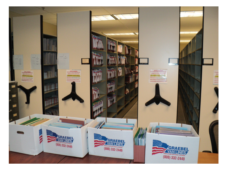
Streamgage documents being made available through Data Rescue projects.