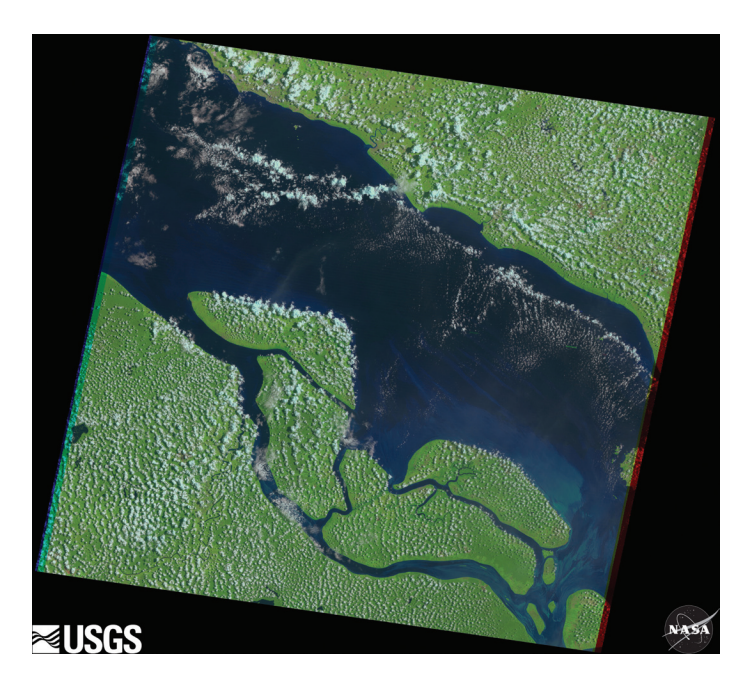
USGS Landsat archive was able to capture clearer views, as seen above, taken by Landsat 5 Thematic Mapper. (Image date: June 2000.)