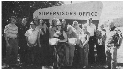
Five Siskiyou County fire safe councils received U.S. Forest Service community protection grants totaling $295,000 at an awards ceremony at the Klamath National Forest Supervisor's Office.

The Klamath National Forest, Scott/Salmon Ranger District has created a successful collaboration model through participating agreements and collective project planning with local organizations. The Forest and District level management and planning personnel have supported and participated in the strategic planning of hazardous fuel reduction projects within various areas of Siskiyou County, California and have championed the acquisition of third party grant funding. Likewise, local organizations have supported and participated in the planning of forest management projects on public lands which has helped to gain public support. This ongoing collaboration has also lead to a liaison concept whereby local organizations provides critical landscape information to fire management teams that may come into the area.