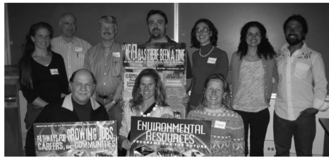
Environmental Resources Faculty and Staff

College of the Siskiyous (COS) offers a Environmental Resources program that provides students with education, hands-on training, and exploration of the relationships between people and natural systems for sustainable jobs, careers, and communities. The program is a unique collaboration of three distinct yet closely interrelated programs. Associate of Science Degrees and certificates are available in Resource Technology, Power Generation Technology, and Sustainable Communities.