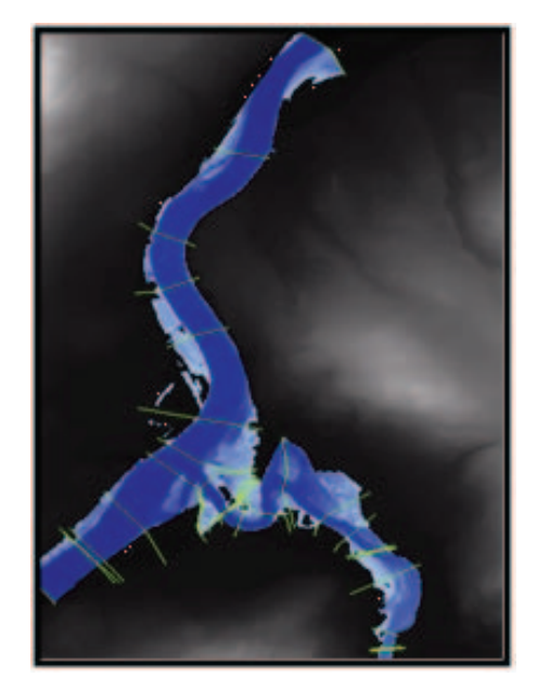
Figure 2. Lidar data for Fort Kent, Maine, 2009. (Lidar, light detection and ranging)

an Acoustic Doppler Current Profiler (ADCP) referenced to the elevation of the water surface at the time of the survey. Underwater and channel-bank field-survey data were merged with lidar data to create a final base map of high-precision elevation data.