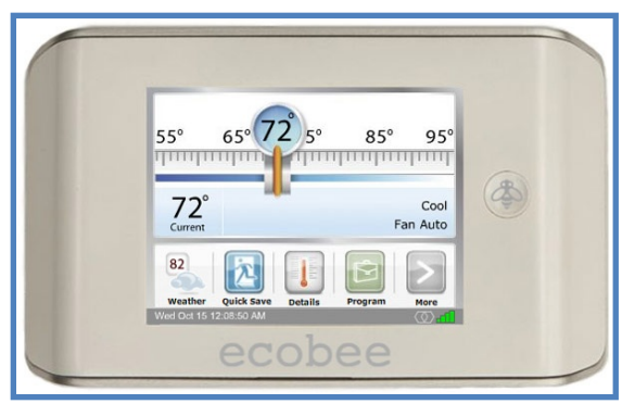
Figure 2. Ecobee thermostat

New technologies also provide opportunities for better monitoring. Devices that differentiate between consumptive uses provide greater resolution into residential energy patterns, which assists homeowners in analyzing areas for potential improvement. Additionally, such