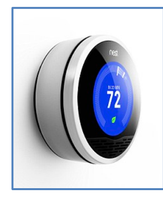
Figure 1. Nest Labs thermostat

ENERGY Energy Efficiency & Renewable Energy