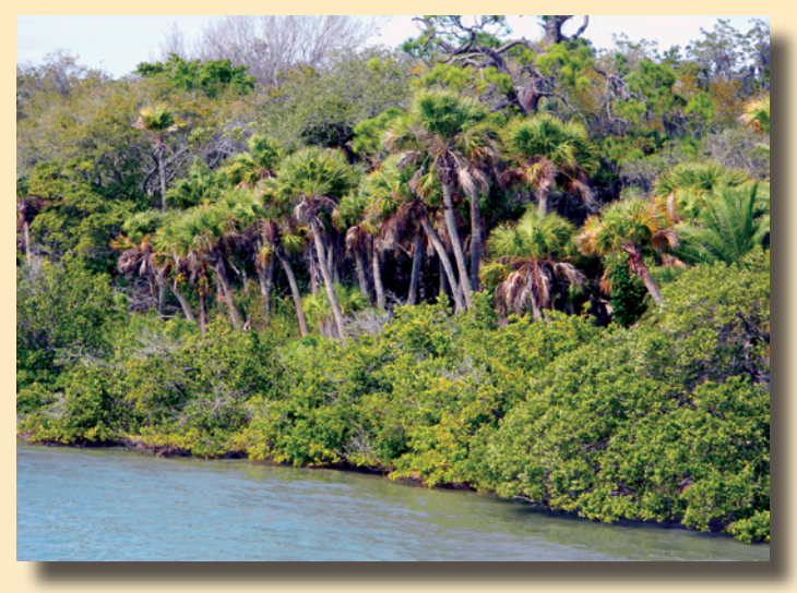
Mangroves on the shoreline of Sarasota Bay. The native mangrove and palm trees provide important services, including protection from erosion by wave action and habitat for animals that live near the shore.

To plan for the sustainable use of coastal areas, as recommended by CMSP methods, it is important to know the current