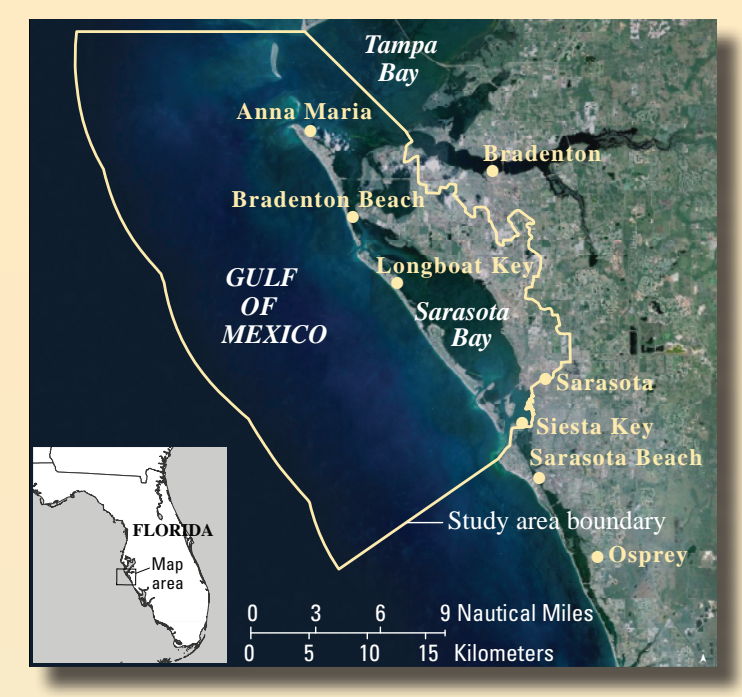
Greater Sarasota Bay region. Base map from World Imagery by Esri, Inc., 2012, 1:400,000.

Ultimately, our goal is to integrate these methods with CMSP principles and procedures and to adapt this research to the needs of decision makers in coastal areas. In the final phase of this project, we will work with groups and individuals from