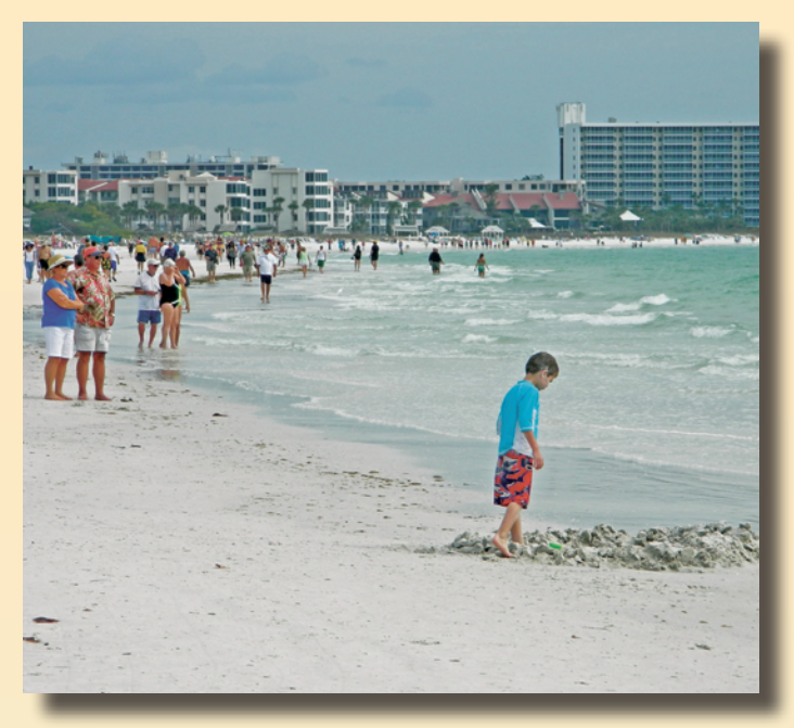
Coastal Florida is highly developed in many places. In this photo, residential and recreational uses coincide in Sarasota County.