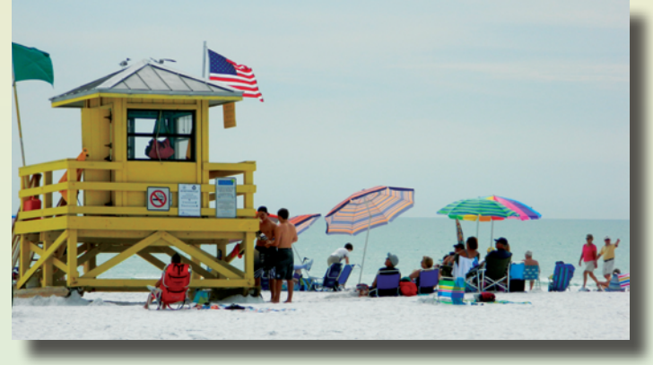
Beaches like this one in Siesta Key, Fla., are important coastal recreational spaces, drawing tourists and supporting local economies.

People living in coastal zones, and most of humanity, rely on marine and coastal systems for essential goods and services to maintain livelihoods and lifestyles. Shipping, energy production, and fishing are common examples of goods and services—stemming from marine and coastal spaces—that benefit humanity. The 2010 Deepwater Horizon explosion and subsequent oil spill is a vivid example of an event that compromised numerous goods and services of vital and immediate economic and social importance to residents of the Gulf of Mexico. The spill demonstrated that, while relatively few individuals are directly affected by oil spills, the stress of fishery closures that often follows quickly reverberates through communities and regional economies (Webler and Lord, 2010).