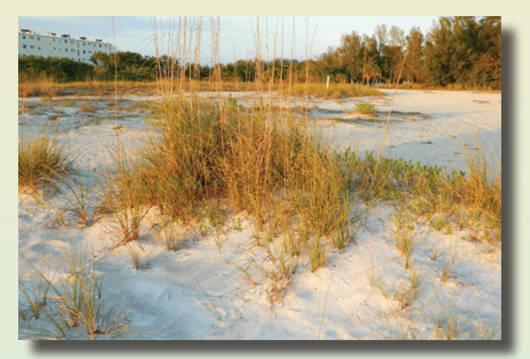
Dune grasses are critical for maintaining habitat quality. These plants offer important ecosystem services, including protecting sandy beaches from erosion and providing habitat for birds and other shore-dwelling animals.

We anticipate that project results will increase scientific and geographic knowledge of how Sarasota Bay residents value their area's cultural ecosystem services. Also, the quantitative spatial models resulting from this research will allow us to extend analyses beyond the study area and predict how similar resources may be valued in other locations. This research contributes to our understanding of how perceptions, knowledge, and values of ecosystem services drive individual and collective decisions and actions that affect Gulf of Mexico coastal economies and resiliency. Finally, because a critical goal of this research is to translate the scientific results into information that can be used in CMSP applications, we will work with interested stakeholders in the region to formulate a product that can benefit the sustainable management of coastal resources.