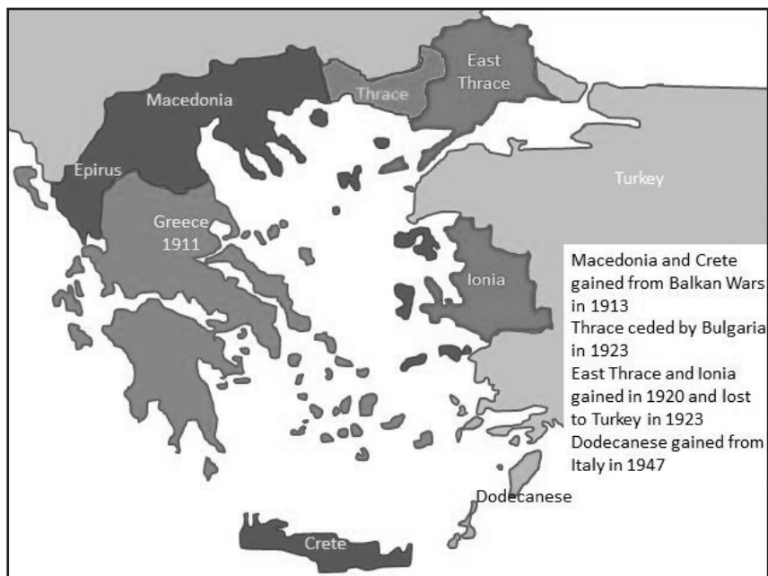
Figure 1. Map of Greek Territorial Expansion

for centuries. 8 Slavic-language speaking peoples, instead of Greek speakers inhabited these new territories. Additionally, the majority of the refugees from Asia Minor, who spoke Turkish, settled in the northern territories. These factors created a northern population in Greece that the Greek-speakers in the more affluent south suppressed and alienated, leading these northern areas to be a reliable base of support for the future communist movement. 9 The economic hardships led to the formation of the Greek Communist Party (KKE) in 1918. 10 The KKE had a poor showing at its first election in 1923, but continued to grow. 11