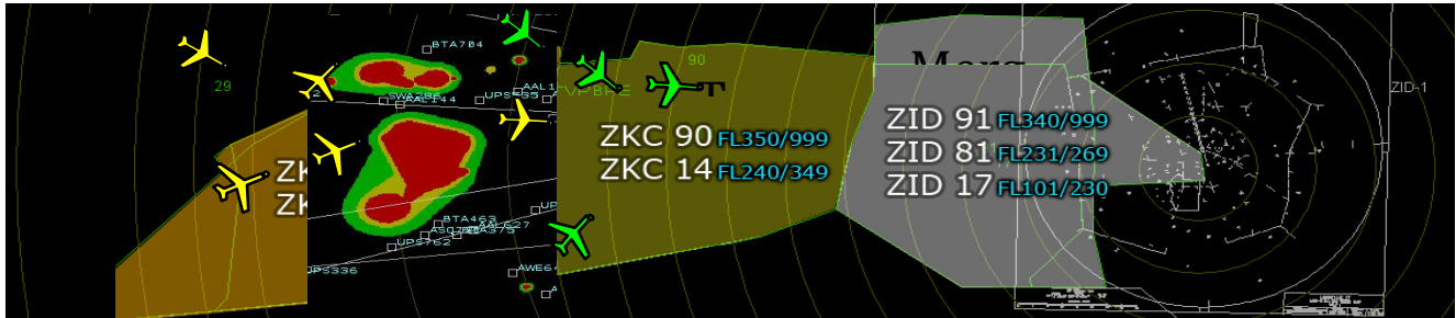
Figure 2. Simulated airspace for distributed air-ground simulations.

A series of distributed air-ground simulations were run during the period of the NRA. These involved simulation roles being played by two or more member organizations. Scenarios for each distributed simulation conducted as part of the NRA were based on sectors in Kansas City Center (ZKC) and Indianapolis Center (ZID), with participant pilots flying en route, arrival and approaches to Louisville International Airport (SDF), while avoiding weather and managing spacing, as shown in Figure 2.