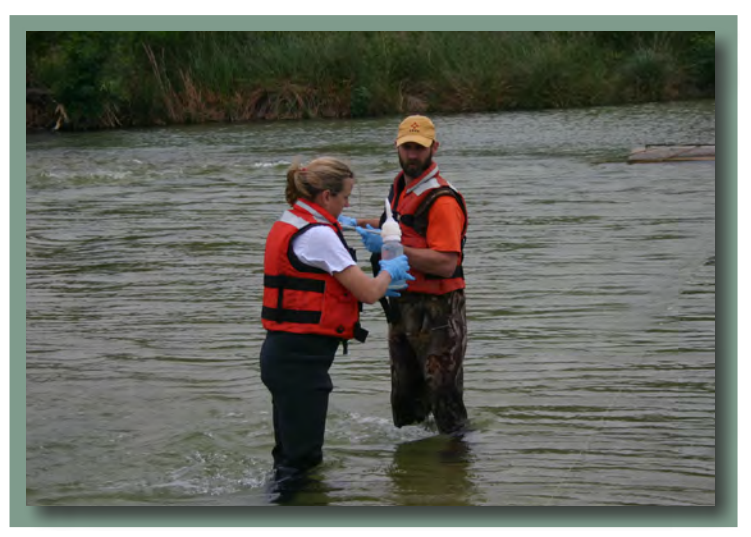
U.S. Geological Survey field crew sampling a National Water-Quality Assessment (NAWQA) Program surface-water site.