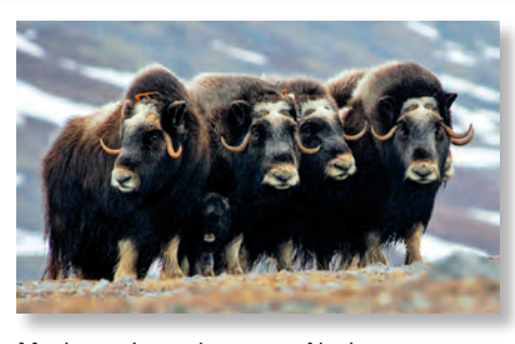
Muskoxen in northwestern Alaska.

Quantifying the demographic impacts of wildlife diseases also will provide a more accurate assessment of other mortality factors (for example, hunting or environmental stressors associated with climate change) that could be important for management actions. An ongoing study of emperor geese in Western Alaska allows for detailed investigation of the effects of blood parasites on specific fitness parameters, including reproductive