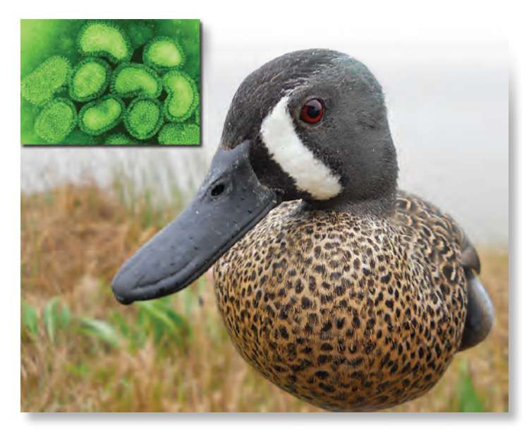
Blue-winged teal in Texas. Inset shows avian influenza virus.

Both large- and small-scale animal movements have important implications for pathogen distribution. Research on the migration of waterfowl and other avian species plays a key role in evaluating potential routes of disease transport by wild birds. The emergence a highly pathogenic strain of H5N1 avian influenza virus that causes severe illness in birds and humans has heightened concerns about the potential role of wild birds in the transfer of disease between flyways. More than 2 million individuals of 94 species migrate to Alaska from Asia each spring. Recent studies by the Alaska Science Center demonstrated that migratory pathways of avian hosts could serve as links between H5N1 influenza outbreak sites in Asia and breeding areas of birds in Alaska. Waterfowl sampled in Alaska carried viruses with Asian-origin genes, and some of these viruses were transferred across multiple species.