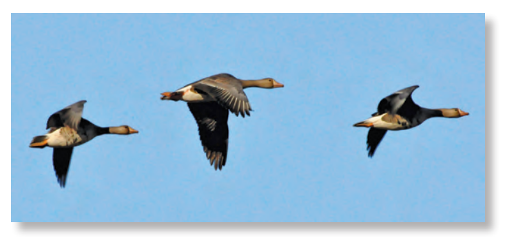
Greater white-fronted geese on the Arctic Coastal Plain.

Environmental contaminants threaten the health of wildlife and humans in the Arctic. Pollutants from lower latitude sources travel by large-scale atmospheric transport, driven by global wind and water currents, to the Arctic. Climate warming and increased anthropogenic activities, such as those related to mining and other natural resource extraction, may contribute to overall contaminant burdens. Some of these compounds persist in the environment for many years and accumulate in living organisms, especially in high trophic level predators like marine mammals. Contaminants in subsistence foods are of particular concern as many indigenous Alaskans rely on traditional sources of meat, fish, and berries. The Alaska Science Center is working with partners to measure levels of nutrients and contaminants in physical and biological samples and to evaluate potential effects on wildlife.