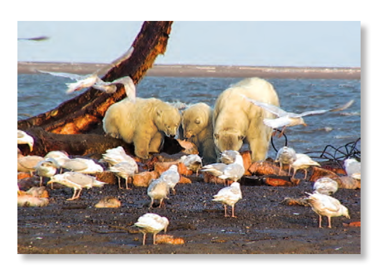
Polar bears and gulls feed on a whale carcass on the Arctic coast of Alaska. This is a possible transition zone for disease transmission.

Certain landscape features, such as those unique to the Arctic coastline, provide critical ecological transition zones that also may influence patterns of disease transmission. The intersection between sea water, sea ice, terrestrial land mass, and fresh water from major river deltas draws a diverse assemblage of species. Overlap in these environments creates an opportunity for pathogen exchange between primarily marine hosts (like polar bears, seals, and walruses) and terrestrial hosts (like caribou, gulls, foxes, and grizzly bears). Changing environmental conditions, primarily the loss of sea ice, has resulted in larger aggregations of birds and mammals on land, forcing more frequent encounters between historically segregated species or populations. Future investigations will target potential exchange of pathogens between marine and terrestrial hosts at these transition zones.