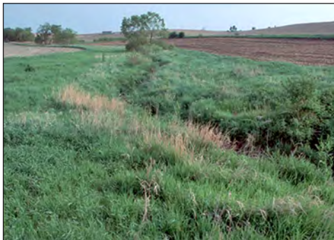
Figure 2. Filter strips are used in conjunction with terraces in Sarpy County, Nebraska, to help keep sediment and other contaminants from migrating into adjacent waterways.