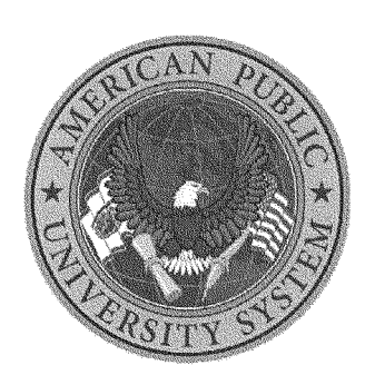
Exhibit 4 Federal Register Vol 78, No. 157 Military MOU