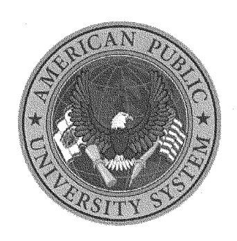
Exhibit 3 Standards of Good Practice for Servicemembers Opportunity Colleges