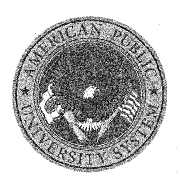
Exhibit 1 American Public University System Profile