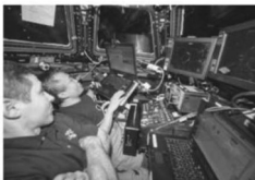
NASA JOHNSON SPACE CENTER

"We're trying to commercialize the station and inspire the nation by using a minimum of 50 percent of upmass and downmass and astronaut time for the benefit of mankind here on Earth,"