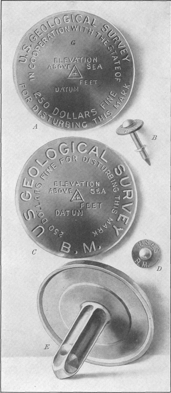
GEOLOGICAL SURVEY BENCHMARKS.

A, Tablet used in cooperating States. The State name is inserted at G. B and D, Copper temporary benchmark, consisting of a nail and washer. A, C, and E, Tablets for stone or concrete structures.