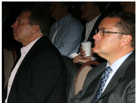
2012 SmartWay Excellence Award Recipients, carrier representatives