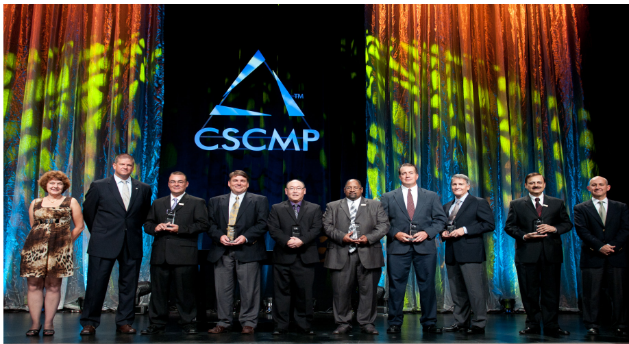
2012 SmartWay Excellence Award Recipients, Shipper and Logistic company representatives.

J.B. Hunt Transport, Inc. Schneider National, Inc. White Arrow LLC