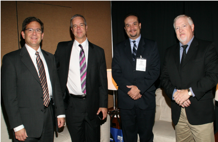
2012 SmartWay Excellence Award Recipients, carrier representatives