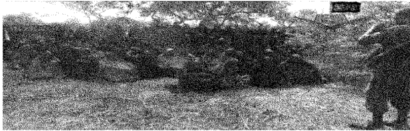
A screenshot of the second video of the Chibok schoolgirls shows an Islamic State-styled flag, which was then new for Boko Haram, and a uniformed militant filming and "interviewing" the girls (May 2014)

In the first Chibok video featuring Shekau, Shekau also chanted Islamic State slogans ( dawlat al-Islam qamat, dawlat al-Islam baqiya ) and for the first time referenced the previously exclusively Ansaru narrative of Usman dan Fodio. Moreover, Islamic State recognized the Chibok kidnapping in its magazine Dabiq and via the Tunisia/Libya-based media outlet Africa Media. It is also important to consider that the Chibok kidnapping reflects Ansaru TTPs and "post-Ansaru" networks seem to be involved in the female suicide bombings, which do not employ the Chibok girls but began only two months after the Chibok kidnappings and have since involved nearly 200 girl "attackers" in a 20-month period. It appears that the faction behind the Chibok kidnapping (a pro-Islamic State formerly Ansaru-connected one coordinating with Shekau) relates to the one behind female suicide bombings, possibly under oversight of ex-Ansaru commander Khalid Al-Barnawi.