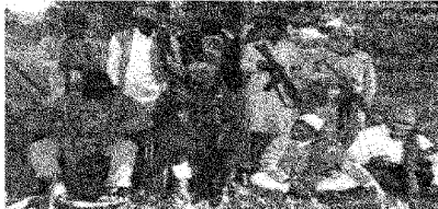
Senegalese “colony” in Sirte, Libya under “Islamic State in West Africa Province” (2016) 14

In late 2015, in addition to Boko Haram (and Ansaru) members “migrating” to Libya, there were also Senegalese funding networks of Boko Haram in Niger. This coincided with reports of a Senegalese “colony” in Sirte, Libya, which is under Islamic State control are arrests of a Boko Haram cell in Senegal. The Senegalese ties to Boko Haram may therefore be maturing.