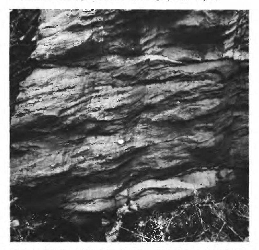
FIGURE 5.—Outcrop of Ramseyburg Member showing refracted cleavage, crossstratification, and graded bedding. Bedding dips steeply southeast (overturned), and cleavage dips gently southeast. Light-colored beds are graywacke, and darkcolored beds are slate.

Claystone intervals within the member have the same well-developed, penetrative slaty cleavage so characteristic of the formation as a whole. The graywacke, in addition, displays a poor-to-good fracture cleavage that in areas of more intense deformation passes into a flow cleavage marked by alined sericite and chlorite. Characteristically, the cleavage is refracted where it passes from slate into graywacke (fig. 5).