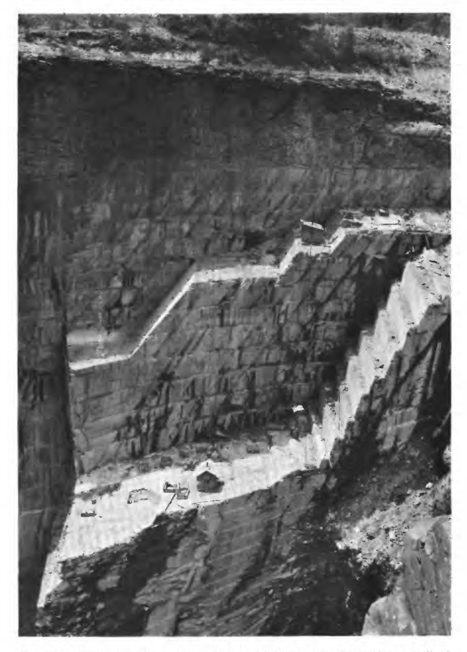
FIGURE 6.—Typical exposure of the Pen Argyl Member in the southwest wall of the Albion Vein Slate Co. quarry, Pen Argyl, Pa. Beds exposed are as much as 8 feet thick and lie in the inverted limb of a recumbent syncline, the axis of which lies about 400 feet below the surface. Bedding dips 45° SE. (left) at the surface and is almost vertical at the bottom of the photograph. Cleavage dips about 10° SE., almost parallel to the axial surface of the fold.