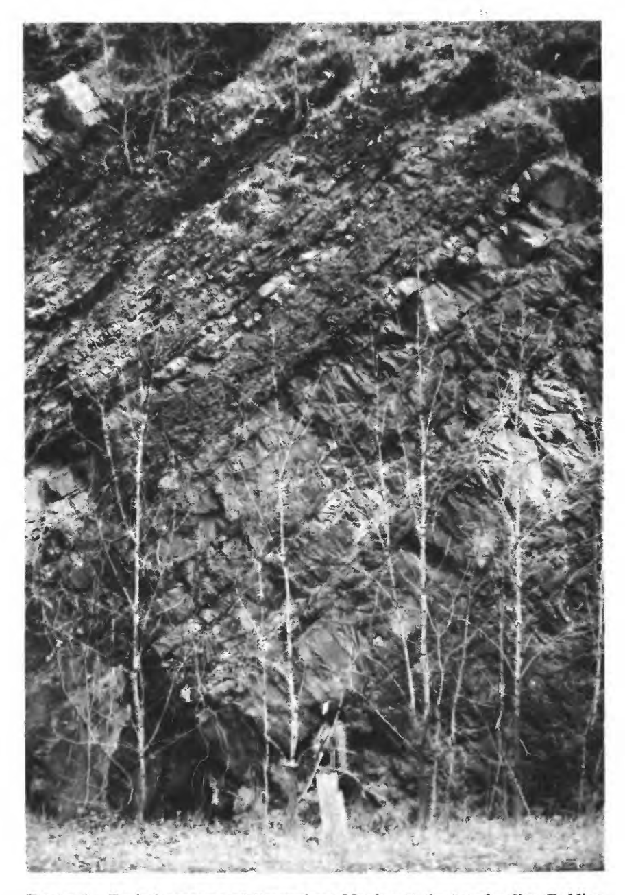
FIGURE 4.—Typical exposure of Ramseyburg Member at the type locality. Bedding dips 45° NW., slaty cleavage dips more gently northwest, and fracture cleavage dips 60° SE. Note the range in thickness of the graywacke beds and of the sedimentary cycles.