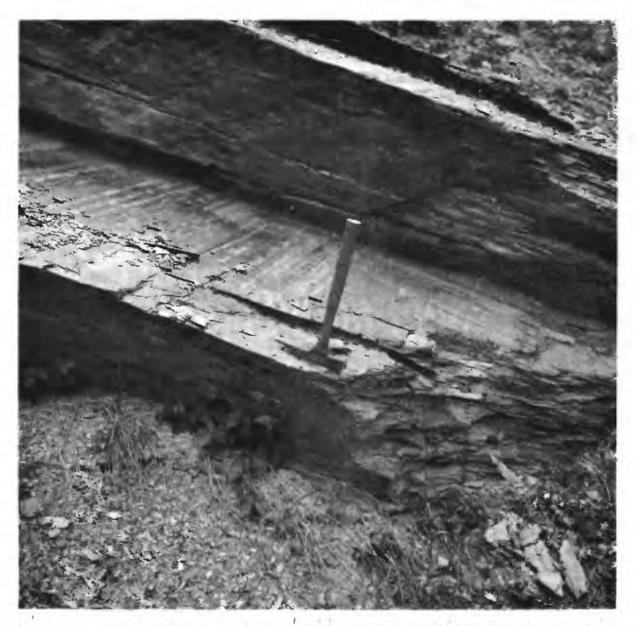
FIGURE 3.—Typical outcrop of ribbon slate in the Bushkill Member along unnumbered county road in Belvidere quadrangle, Northhampton County, Pa., about 1.4 miles S. 63° W. from Manunka Chunk, N. J. Bedding dips gently northwest, cleavage dips gently southeast, intersection plunges 10° toward the viewer.

The Bushkill Member consists of thin-bedded, dark-gray to darkmedium-gray claystone slate that weathers medium gray to very light gray to yellowish-brown. The slate contains thin to very thin interbeds of quartzose and graywacke siltstone and carbonaceous slate. Beds range in thickness from less than 1/8 inch to as much as 3 or 4 inches; about 75–80 percent of the beds are probably less than half an inch thick. On Bushkill Creek, seven dolomite beds, ranging from 6 to 12 inches in thickness, lie 20–250 feet above the Martinsburg-Jacksonburg contact. Slaty cleavage is the dominant planar feature in the Bushkill