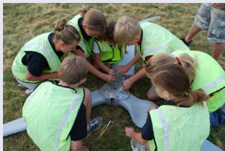
Students at Idaho's Pocatello Community Charter School participated in a Wind for Schools project.

As the United States dramatically expands wind energy deployment, the industry is challenged with developing a skilled workforce and addressing public resistance. Wind Powering America's Wind for Schools project addresses these issues by: