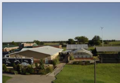
Wind for Schools system installed at Greenbush High School in Kansas.