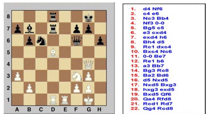
Figure 2. Precise and procedural depictions of a chess game. From [17].

Our discussion so far has emphasized integration of engineering design with downstream functions such as manufacturing or field support. A different scenario is when a design needs to be edited in multiple CAD systems. This may be required when design groups use different CAD software collaborate or when, due to business mergers, acquisitions, partnerships, etc., the design authority migrates between dissimilar systems. Both cases require not only the exchange of precise geometry data but also of design intent, i.e., information about the design process itself. Design intent information generated by CAD systems includes procedures used to create shape models, parameters bound to values in the model, constraints between parameters and/or model elements, and features – the shape “building blocks” used to construct the model. Without design intent, a model cannot be easily edited. [17][18] This is because the precise geometry shows only the final result and says nothing about the steps that got you there. A good analogy – given in [17] and illustrated in Figure 2 – is the representation of a chess game. A board diagram is a “precise” model in that it gives a comprehensive view of the current state of the game. But it lacks information regarding the sequence of moves leading up to the current state. In order to refine a design – or fine-tune a chess playing strategy – one needs that procedural information.