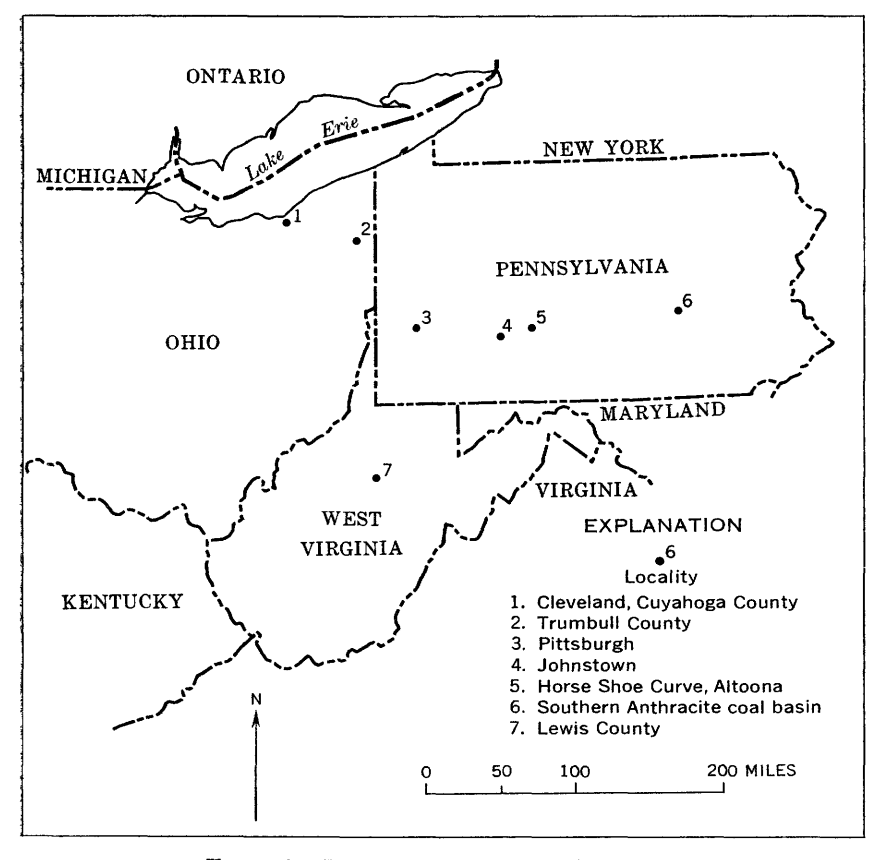
FIGURE 3.—Localities mentioned in this report.

they are long-ranging nondiagnostic forms or are too fragmentary for specific identification. In contrast, the overlying Sunbury Shale contains a conodont zone, characterized by several species of Siphonodella, in its basal beds throughout a large area in the western part of the Appalachian basin. The several species of Siphonodella which occur abundantly in the basal zone of the Sunbury permit correlation of the Sunbury with the Hannibal Shale and other Siphonodella-bearing units in the Lower Mississippian strata of the Mississippi Valley area (Hass, 1947, p. 136; 1956, p. 25). The Sunbury Shale is clearly of Kinderhook age from its contained conodont fauna. In northern Ohio the main problem is to resolve the age and correlation of the relatively unfossiliferous strata between the fossil zone of possible very Late Devonian age in the base of the Bedford Shale and the zone of Early Mississippian conodonts of Kinderhook age in the basal part of the Sunbury Shale.