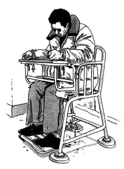
Illustration of a suspect restrained in what the police call an "interrogation chair," but commonly known as a "tiger chair." Former detainees and

The 145-page report, "Tiger Chairs and Cell Bosses: Police Torture of Criminal Suspects in China." is based on Human Rights Watch analysis of hundreds of newly published court verdicts from across the country and interviews with 48 recent detainees, family members, lawyers, and former officials. Human Rights Watch found that police torture and ill-treatment of suspects in pretrial detention in China remains a serious problem. Among the findings are that detainees have been forced to spend days shackled to "tiger chairs," hung by the wrists, and treated abusively by "cell bosses" – fellow detainees