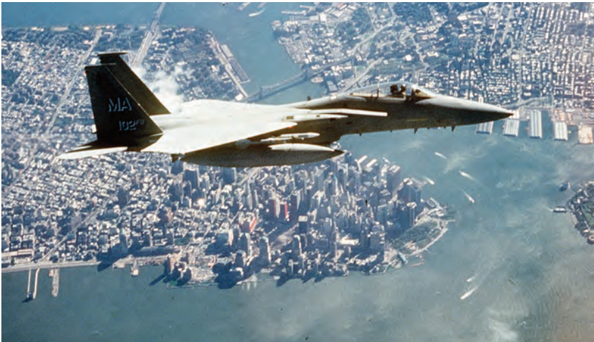
An F-15 of the 102d Fighter Wing, Massachusetts Air National Guard, flying over lower Manhattan and Ground Zero during an Operation Noble Eagle combat air patrol mission several months after the 9/11 attacks.