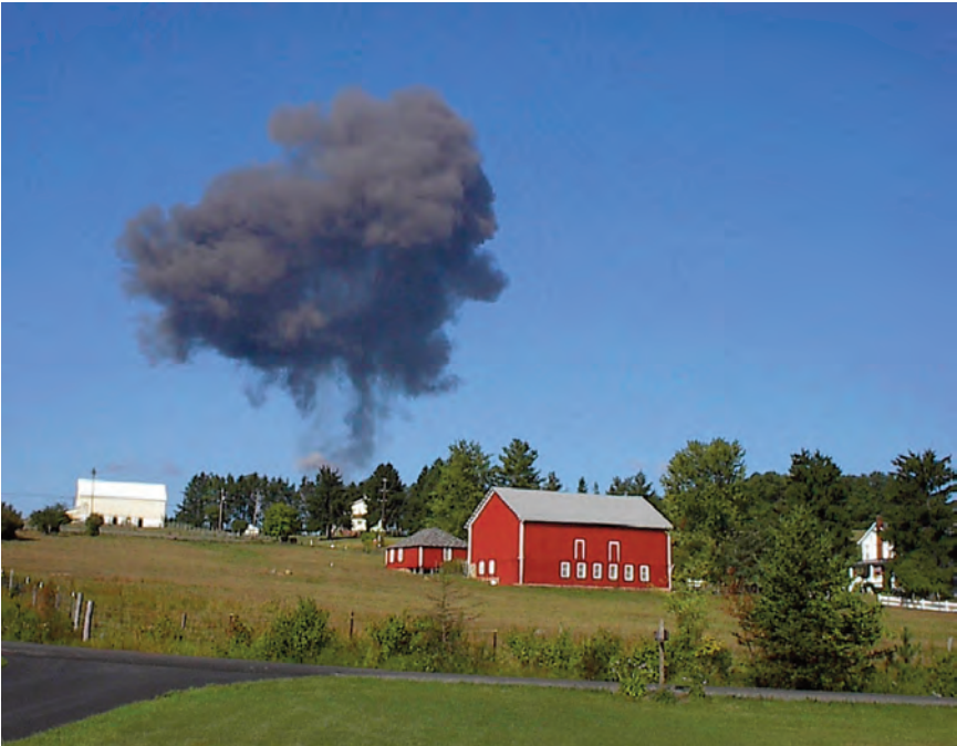
A gray smoke plume rising above the crash site of United Airlines Flight 93 near Shanksville, Pennsylvania.