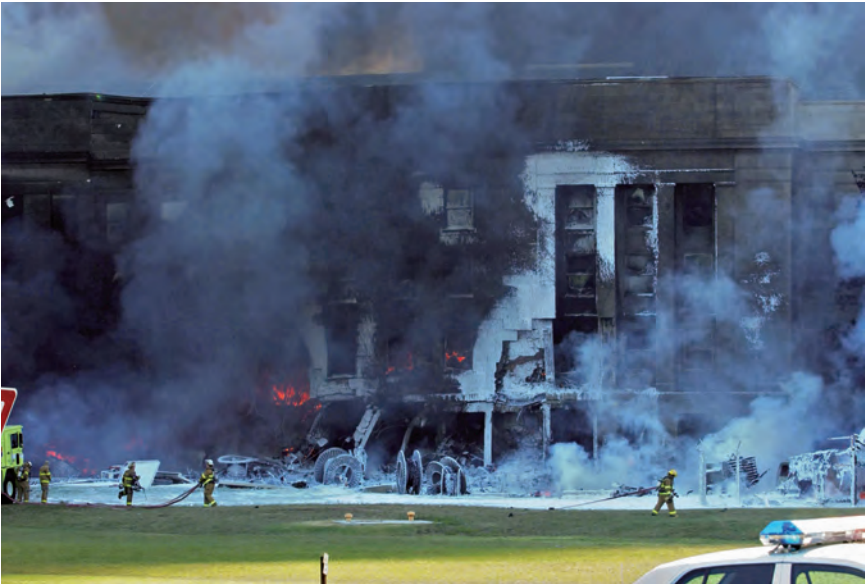
The Pentagon in flames, minutes after the crash of American Airlines Flight 77. Foam residue is visible on the building’s facade, before its collapse.