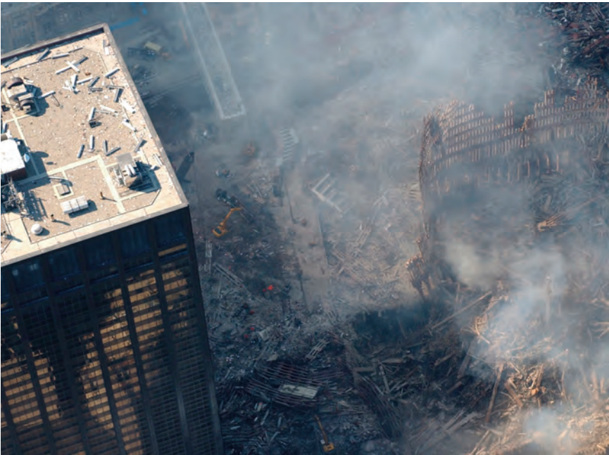
Rubble at Ground Zero, September 19, 2001, one week after al Qaeda terrorists flew American Airlines Flight 11 and United Airlines Flight 175 into the World Trade Center towers, causing their collapse.