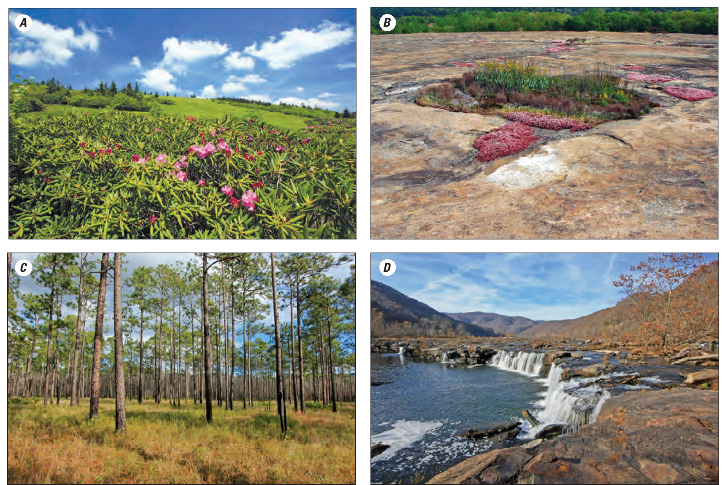
Examples of ecosystems that were analyzed to assess climate-change vulnerability included, A , montane grass and heath balds, B , granite outcrops, C , longleaf pine savannas, and D , flood-scoured riparian areas.

Two recent investigations of climate-change vulnerability for 19 terrestrial, aquatic, riparian, and coastal ecosystems of the southeastern United States have identified a number of important considerations, including potential for changes in hydrology, disturbance regimes, and interspecies interactions. Complementary approaches using geospatial analysis and literature synthesis integrated information on ecosystem biogeography and biodiversity, climate projections, vegetation dynamics, soil and water characteristics, anthropogenic threats, conservation status, sea-level rise, and coastal flooding impacts. Across a diverse set of ecosystems—ranging in size from dozens of square meters to thousands of square kilometers—quantitative and qualitative assessments identified types of climate-change exposure, evaluated sensitivity, and explored potential adaptive capacity. These analyses highlighted key gaps in scientific understanding and suggested priorities for future research. Together, these studies help create a foundation for ecosystem-level analysis of climate-change vulnerability to support effective biodiversity conservation in the southeastern United States.