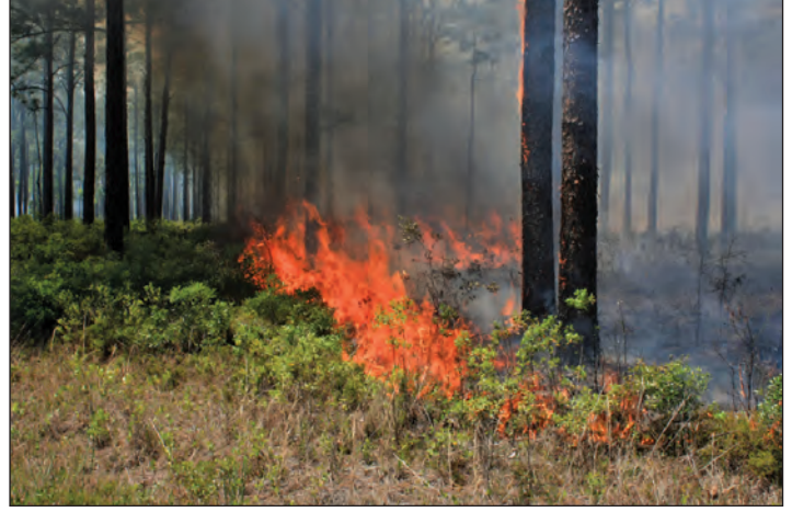
Wildfires and controlled burns are forms of disturbance that are vital to a number of ecosystems of the southeastern United States. The influence of climate change on disturbance dynamics is an important frontier of research.