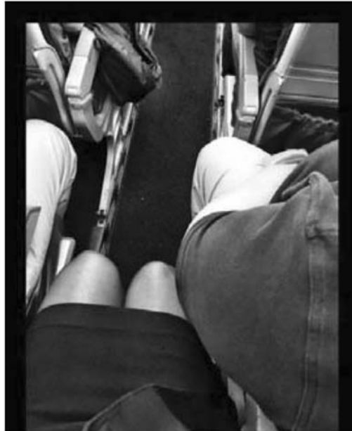
Crewmember jumped on a CRJ-900 regional aircraft

The horrific viral video from Republic flight 3411, operating as United Express, and the force used by the Chicago Aviation Security Officers led to a mob mentality Internet attack on the front-line employee of United Airlines who had no role in the shocking event itself. Such an event of violence should never take place against any person on our planes—we all know this and we also know it can never happen again. The reality is that under the leadership of Oscar Munoz, United Airlines has transformed in a very short period of time. Employees are engaged, management is showing a respect for workers through good relations with unions, which has also resulted in improved contracts and the reverse of outsourcing begun by the former CEO.