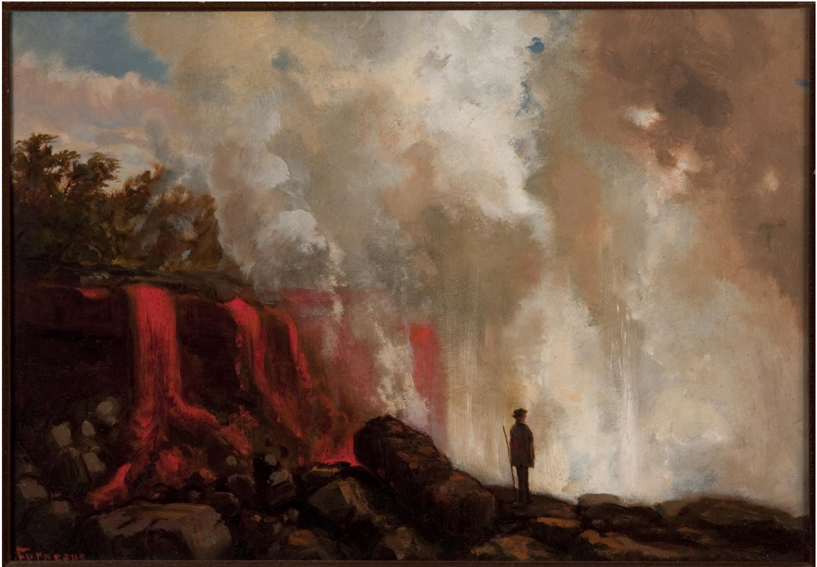
Figure 4. “Man Watching Volcano: No. 3 Lava Fall, 2 Miles Mauka of Hilo, Hawai’i,” by Charles Furneaux. Image courtesy of the National Park Service, Hawai’i Volcanoes National Park, catalog number HAVO 808.