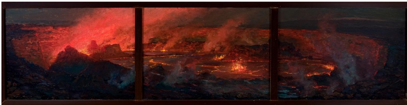
Figure 15. Title unknown, by Lionel Walden. Image courtesy of the National Park Service, Hawai'i Volcanoes National Park, catalog number HAVO 447.

The painting by Lionel Walden shown in figure 15 depicts a block of congealed lava rising above a lake of molten lava in the crater of Halema'uma'u crater. Craggs such as this were common features in Halema'uma'u between 1916 and 1922, and the artist probably depicted the view during this period. Snow-clad Mauna Loa can be seen behind and to the right of the lava lake.