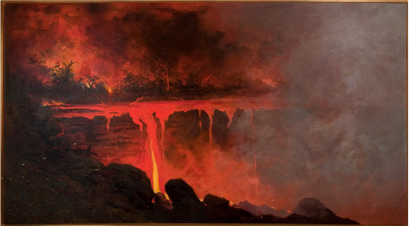
Figure 6. Title unknown, by Jules Tavernier. catalog number HAVO 806.

The painting by Jules Tavernier shown in figure 6 depicts the 1880–81 lava flow from Mauna Loa as it enters a stream near Hilo on July 20, 1881. Tavernier, who arrived in Hawai‘i about 3 years after this eruption occurred, probably used the photograph by Menzies Dickson (fig 5) as the basis for his painting. Both images show a coffin-shaped rock in the foreground, slanting to the left in front of the lava fall.