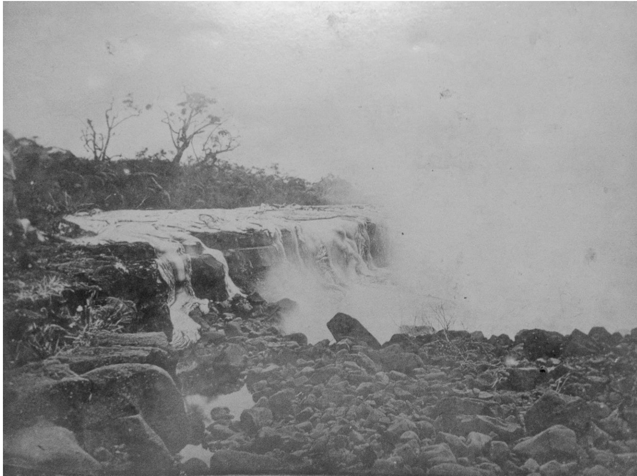
Figure 5. “No. 651 Lava Flow of 1881,” by Menzies Dickson. Image courtesy of the National Park Service, Hawai‘i Volcanoes National Park, catalog number HAVO 1167.

Both Charles Furneaux and Menzies Dickson were present when the lava cascade event occurred. Dickson took a photograph of the lava fall (fig. 5), which may have been used as a basis for Furneaux's painting (fig. 4). The same coffin-shaped rock angles to the left in the foreground in both the photograph and the painting.