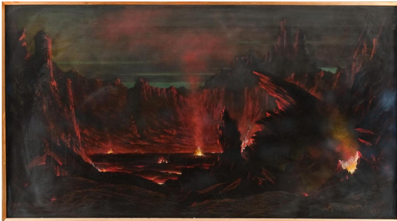
Figure 7. “Volcano—Kilauea, Island of Hawai‘i,” by Jules Tavernier. catalog number HAVO 798.

Many of the Kilauea paintings by Tavernier show ragged slabs of tilted lava crust, but the features of the painting shown in figure 7 seem particularly violent. Was the artist trying to convey the effects of the earthquake the day before? Is this a painting of New Lake, and is the active cone in the lower right Little Beggar?