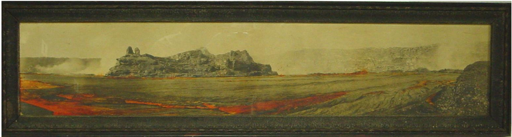
Figure 12. Title and photographer unknown. Image courtesy of the National Park Service, Hawai'i Volcanoes National Park, catalog number HAVO 684.

When he visited Kīlauea in January 1917, William Twigg-Smith painted the scene shown in figure 12, which features the same distinctive twin-spired lava crag shown in figure 13.