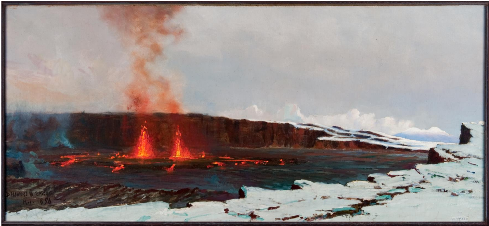
Figure 10. “Mokuaweoweo,” by D. Howard Hitchcock. Image courtesy of the National Park Service, Hawai‘i Volcanoes National Park, catalog number HAVO 451.

The finished oil painting shown in figure 10 was exhibited shortly after the return of the expedition (Pacific Commercial Advertiser, 1896): “Among the contributions are quite a number of D. Howard Hitchcock. The oil painting of the crater of Moku‘āweoweo as it appeared on the occasion of the recent visit of that artist to the summit of Mauna Loa is especially good. The two fountains of fire and the surrounding lava banks are very effectively shown.”