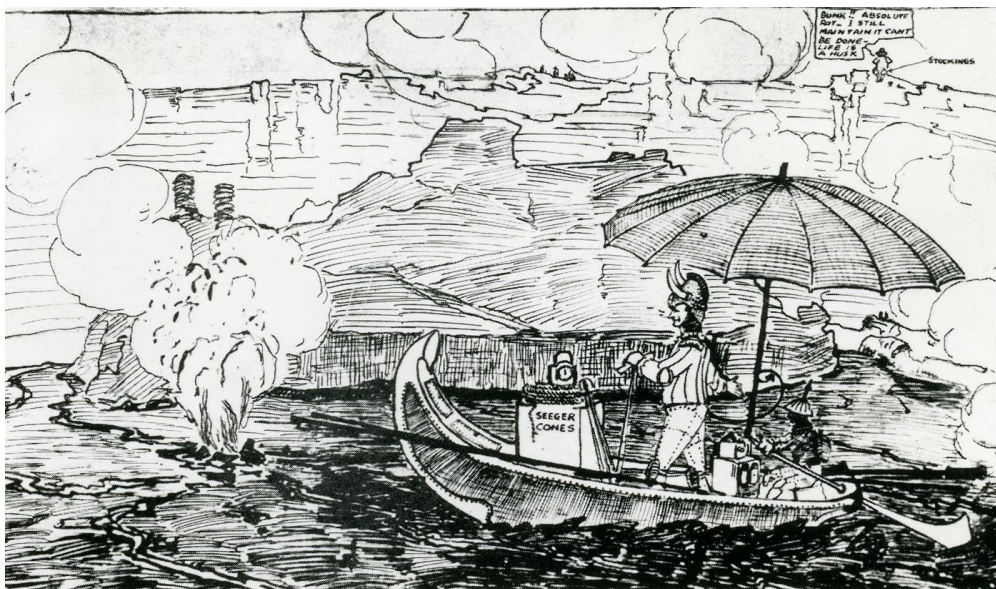
Figure 14. Sketch by William Twigg-Smith (1917) from the Volcano House guest book. Image courtesy of the National Park Service, Hawai'i Volcanoes National Park, catalog number HAVO 401.

The painting by Lionel Walden shown in figure 15 depicts a block of congealed lava rising above a lake of molten lava in the crater of Halema'uma'u crater. Craggs such as this were common features in Halema'uma'u between 1916 and 1922, and the artist probably depicted the view during this period. Snow-clad Mauna Loa can be seen behind and to the right of the lava lake.