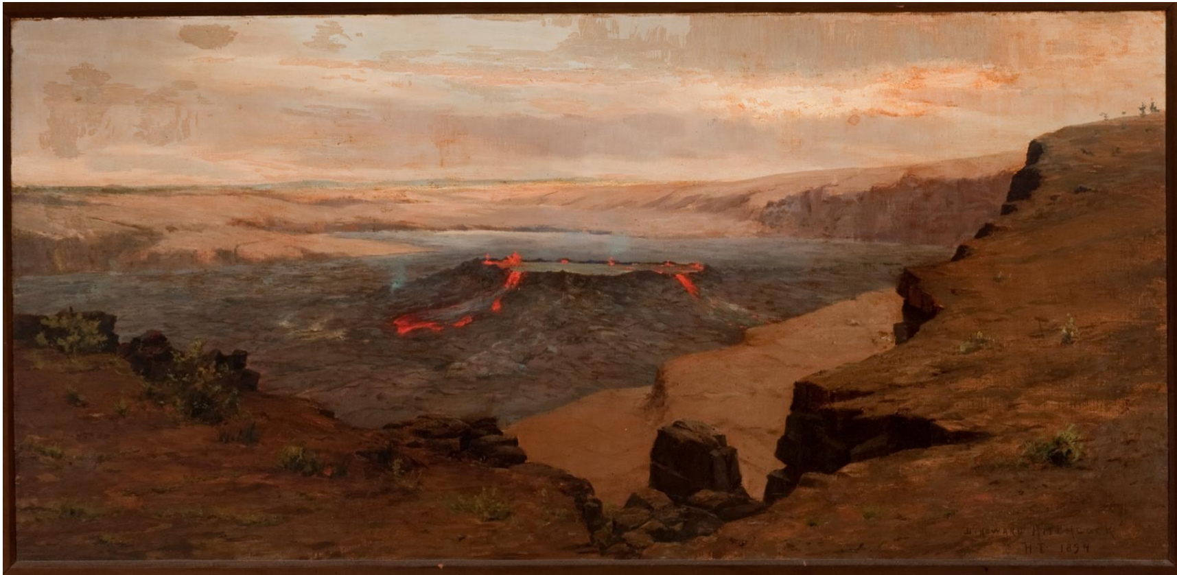
Figure 9. “Dana Lake,” by D. Howard Hitchcock. Image courtesy of the National Park Service, Hawai‘i Volcanoes National Park, catalog number HAVO 804.

The painting by D. Howard Hitchcock shown in figure 9 depicts a lava pond perched on the floor of Kīlauea caldera after filling Halema‘uma‘u crater.