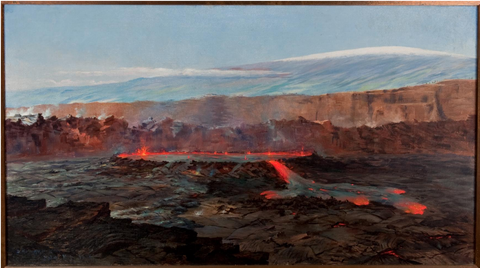
Figure 8. Title unknown, by D. Howard Hitchcock. Image courtesy of the National Park Service, Hawai‘i Volcanoes National Park, catalog number HAVO 452.

The painting by D. Howard Hitchcock shown in figure 8 depicts a lava pond perched on the floor of Halema‘uma‘u crater (dark brown walls just behind the lava lake) within Kīlauea caldera (lighter walls behind the Halema‘uma‘u crater walls) and snow-covered Mauna Loa in the background. Such symmetrical elevated ponds commonly form when a rising lava lake overflows repeatedly, building steep levee walls that allow the lava level to rise above the surrounding terrain. When the levee fails, active flows such as the one depicted in the painting (fig. 8) spill out onto the surrounding crater floor.