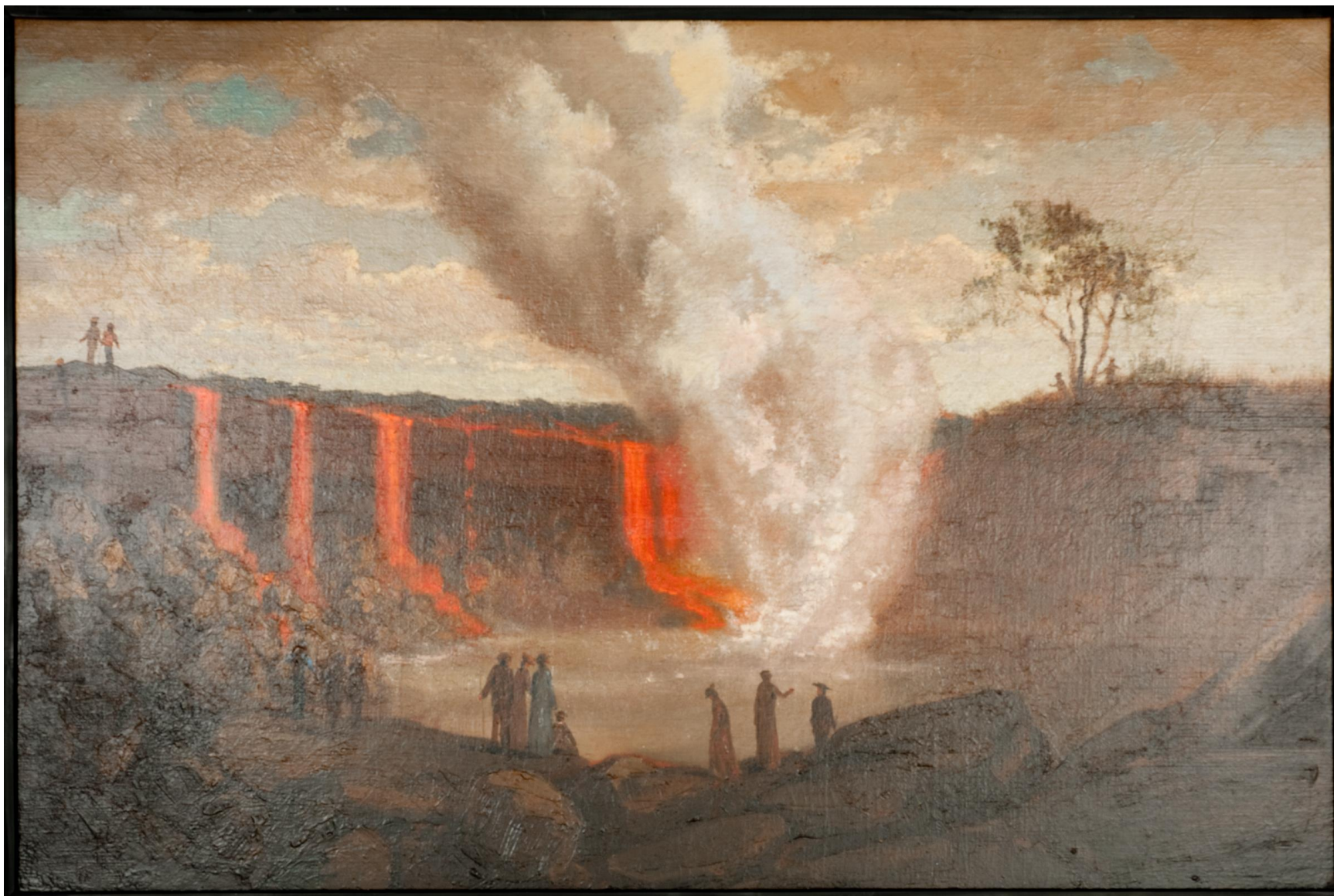
Figure 3. Title unknown, attributed to Charles Furneaux. Image courtesy of the National Park Service, Hawai'i Volcanoes National Park, catalog number HAVO 39.