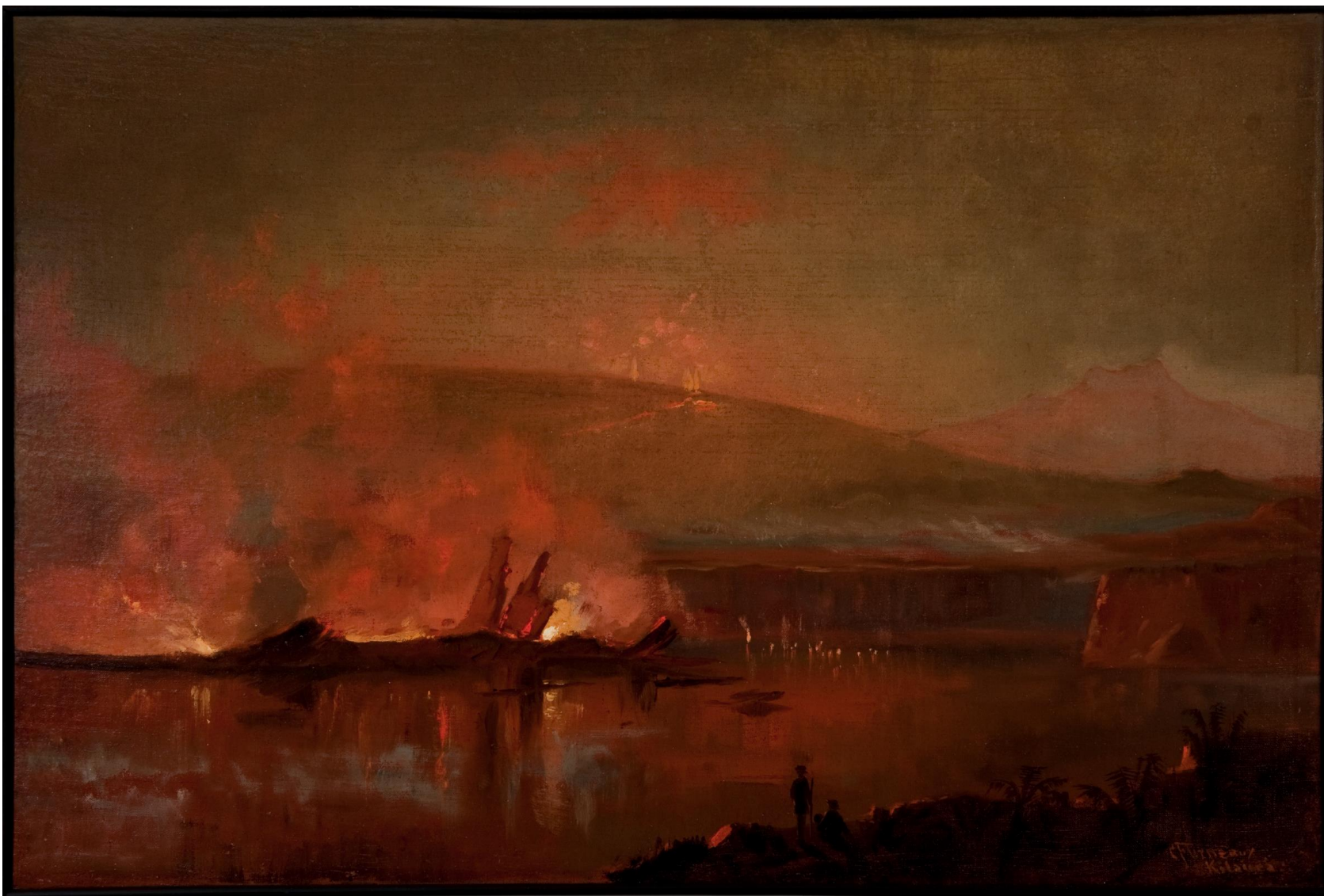
Figure 1. “Kilauea,” by Charles Furneaux.