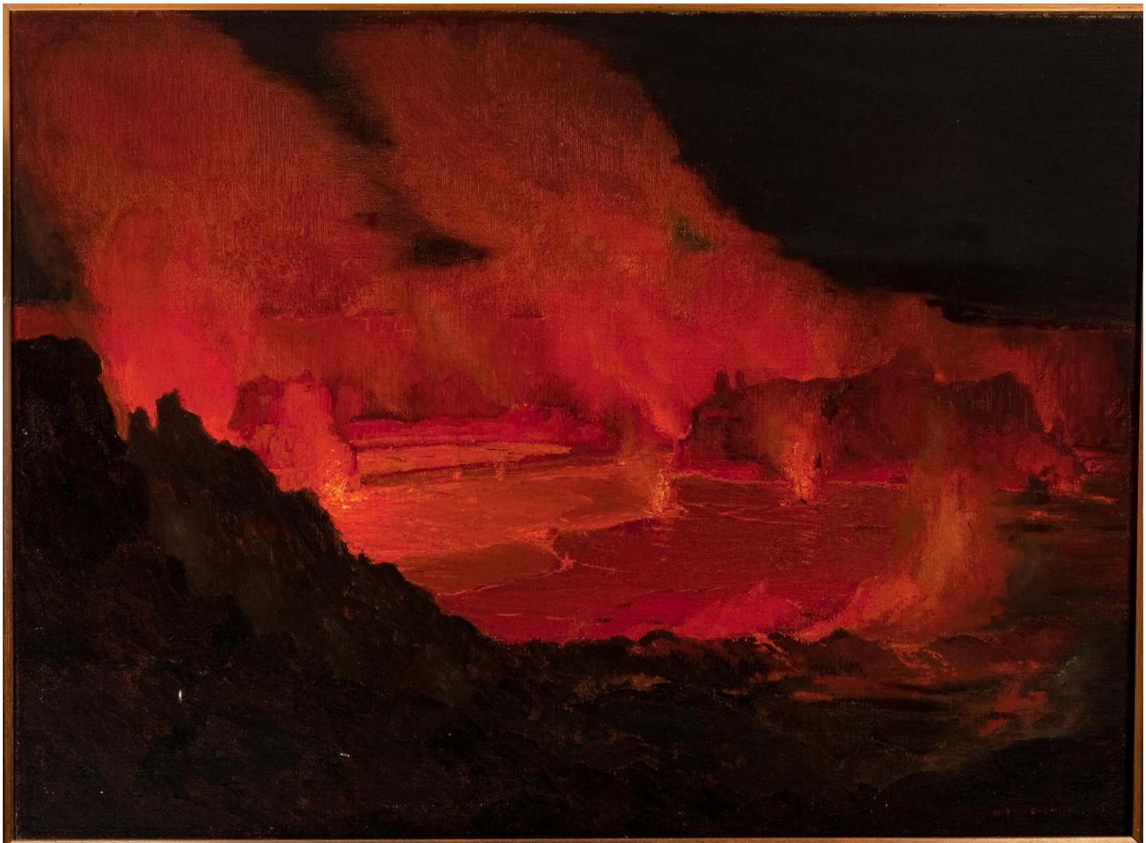
Figure 13. Title unknown, by William Twigg-Smith. Image courtesy of the National Park Service, Hawai'i Volcanoes National Park, catalog number HAVO 807.