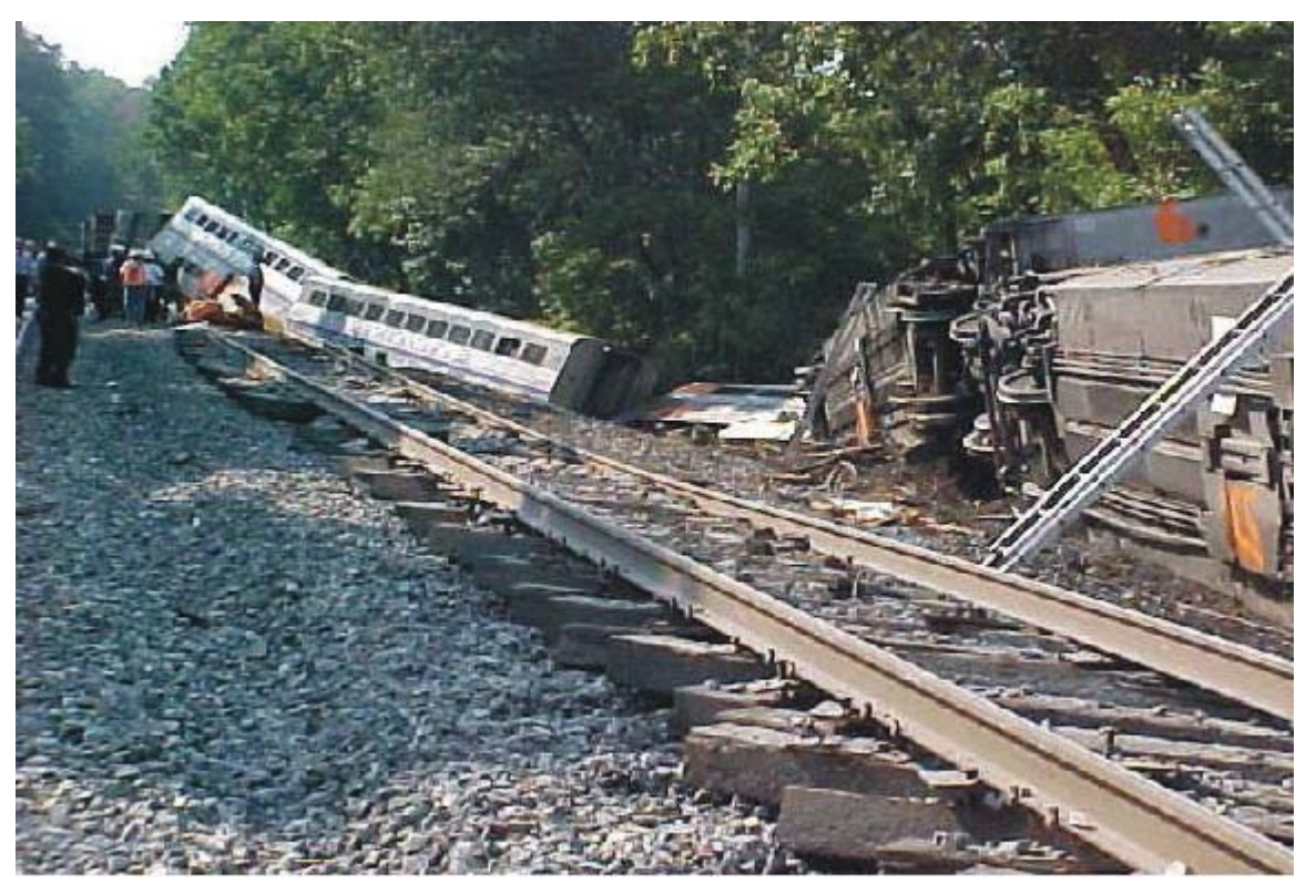
Figure 2. View of wreckage looking south.

handle in emergency. The train's locomotives came to a stop about 400 feet beyond the point of the emergency brake application.