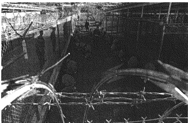
Finally came Category III, for the most exceptionally resistant. Category III included four techniques: the use of "mild, non-injurious place.