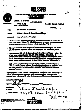
The famous Haynes Memo, recommending enhanced "counter-resistance" techniques, as signed and annotated with a jocular comment by Rumsfeld. Enlarge this.

For two hours Gonzales and Haynes laid out the administration's narrative. Al-Qaeda was a different kind of enemy, deadly and shadowy. It targeted civilians and didn't follow the Geneva Conventions or any other international rules. Nevertheless, the officials explained, the administration had acted judiciously, even as it moved away from a purely law-enforcement strategy to one that marshaled "all elements of national power." The authorized version had four basic parts.