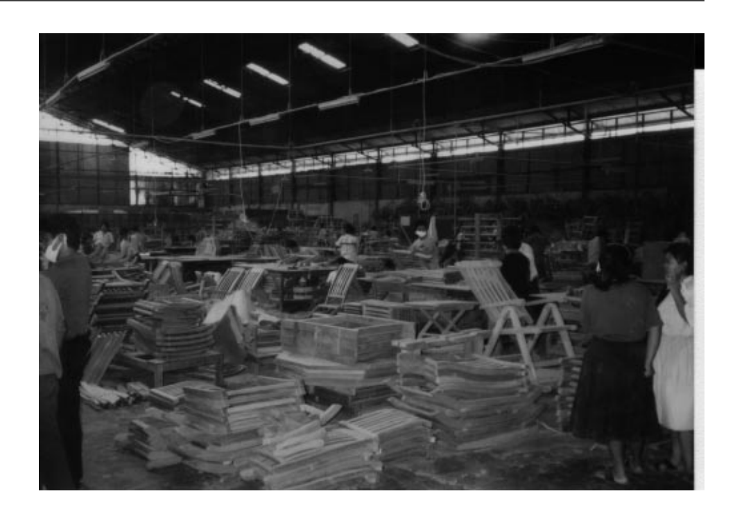
Figure I.2: Furniture Cooperative in Indonesia Supported by Title II Monetized Funds