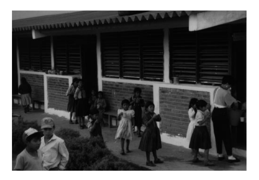
Figure II.1: School Feeding Project in Honduras

Maternal and child health projects generally target children and pregnant and lactating women because of their nutritional vulnerability (see fig. II.2). However, rather than having nutritional goals, projects in all the countries we visited used food as an incentive for mothers to bring children to health centers for inoculations and preventive care. In some projects, nutritional problems were not criteria for participation. For example, in Indonesia, according to PVO and local officials, PVOs have established projects where the government of Indonesia had not provided adequate health coverage. The community health centers used food as an incentive for women to attend classes in nutrition and family planning. According to project officials, although the women served were poor, they were not screened for nutritional status and were not necessarily the poorest. Maternal and child health projects sponsored by Pvos in Honduras and Ghana provided food to poor mothers. The Honduran project provided food to persons who were not eligible under the project criteria, according to a recent evaluation and local project officials. PVO officials told us the project in Ghana may not have served the poorest mothers because they lacked the status to join the informal socializing of mothers who came to the centers.