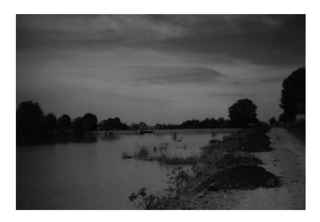
Figure II.5: Dam Built by Food-for-Work Project in Indonesia

In Honduras, a community project coordinator told us that besides constructing a sewage drainage system, the community, with the PVO's help, had resolved other problems with the municipality, such as land titling, electricity, and water hook-up. The coordinator did add, however, that he had encountered problems keeping "trained" workers (i.e., bricklayers). The trained participants were able to get jobs at the government public works program making over three times the daily ration. Although unplanned, one of the long-term impacts may be enabling workers to get higher-paying jobs.