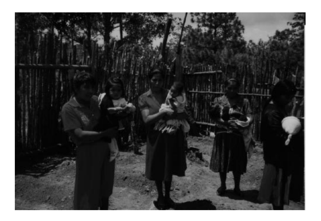
Figure II.2: Maternal and Child Health Direct Feeding Project in Honduras

In commenting on a draft of this report, AID said it recognizes, as the PVOs do, that it is not always possible to reach the most vulnerable groups in a society. It also stated that