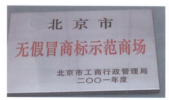
Beijing Administration for Industry and Commerce Sign: "Model Market for No Counterfeit Trademarks, 2001"

Science and Civilization in China. Looking to the future, China has indeed com-mitted significant resources to revamping its laws, establishing a specialized IP court system, implementing specialized administrative agencies with power to fine infringers, and enacting and publicizing laws or measures that may extend beyond TRIPS minima.