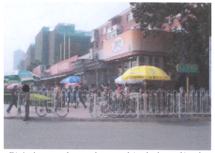
China's role as a manufacturer and consumer of pirated and counterfeit goods not only poisons the Chinese market for U.S. products. It affects our own market and third country markets. This was most evident in the mid-1990s, when China's exports of CD-ROMs of music and software were displacing U.S. exports, especially in Asia. After extensive bilateral discussions and agreements on intellectual property rights, China reduced its exports of pirate CD-ROMs.

Economic analysis can be easily supported by sight observations. Counterfeit and pirated goods continue to be omnipresent in China. They are sold at the Xiushui Market, near the U.S. embassy, in the Luowu market in Shenzhen, and other prominent venues, frequently in view of local authorities. Some industry officials estimate that 15–20 percent of the products sold under their labels are counterfeit. For certain products, it may be difficult in local markets to purchase legitimate goods. Pirated music, movies, motion pictures, video games and books have displaced legitimate sales, frequently before the legitimate product can achieve legal entry into the Chinese market. Pictured below is such a street near the Xiushui market, where a street dealer in DVDs and CDs may frequently be seen.