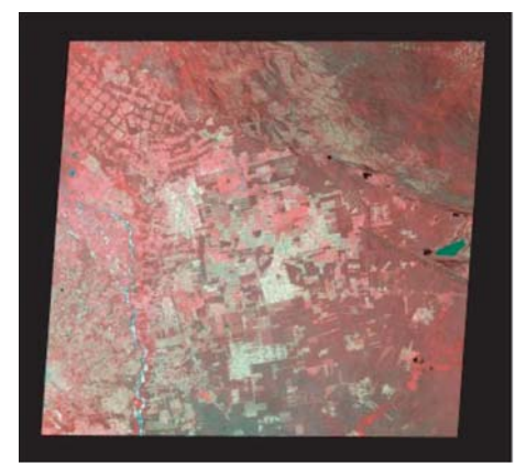
Bolivia clear cutting - 2000

Landsat data have been used by government, commercial, industrial, civilian, military, and educational communities in the United States and worldwide. They support a wide range of applications in such areas as global change research, agriculture,