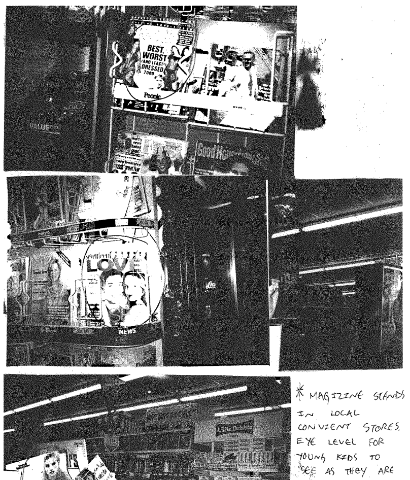
700% KZDS TO SEE AS THEY ARE PERCH BUYING ITEMS.