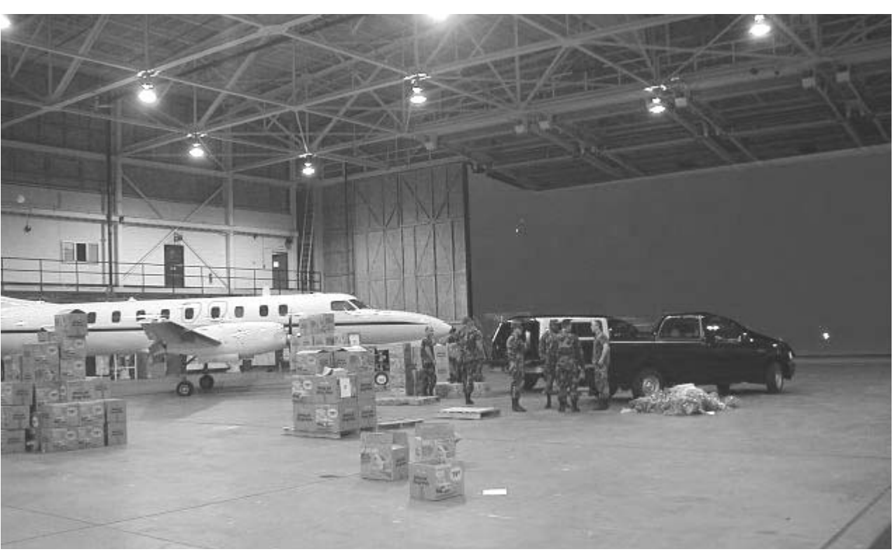
Figure 4: Arrival of a Simulated National Pharmaceutical Stockpile During the TOPOFF 2000 Exercise

Pharmaceutical Stockpile after it has been delivered and unloaded at the Buckley Air National Guard Base, Denver, Colorado. The items in the simulated stockpile were subsequently distributed to hospitals and other points of distribution, such as makeshift medical treatment centers, so that victims could be appropriately treated.