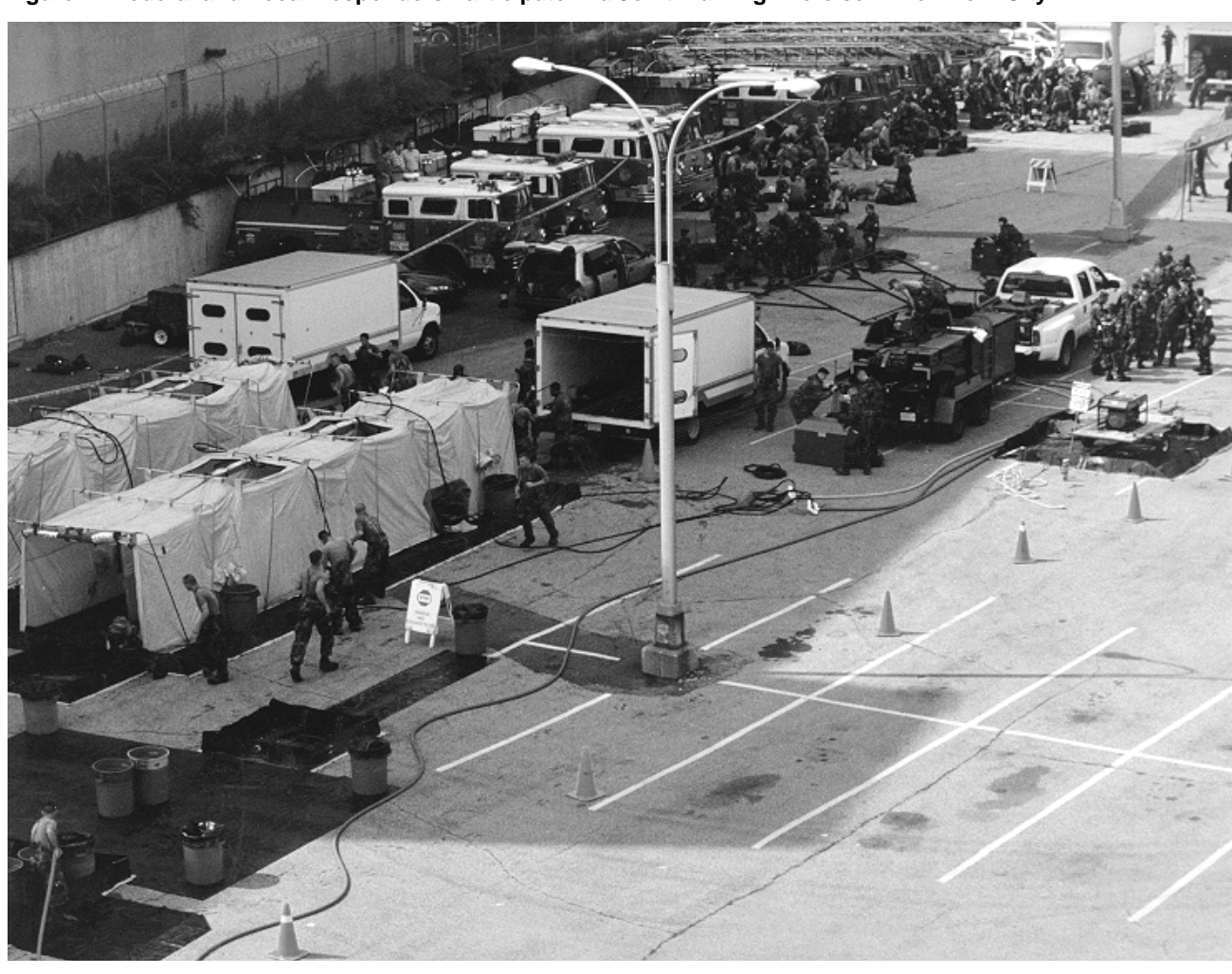
Figure 1: Federal and Local Responders Participate in a Joint Training Exercise in New York City