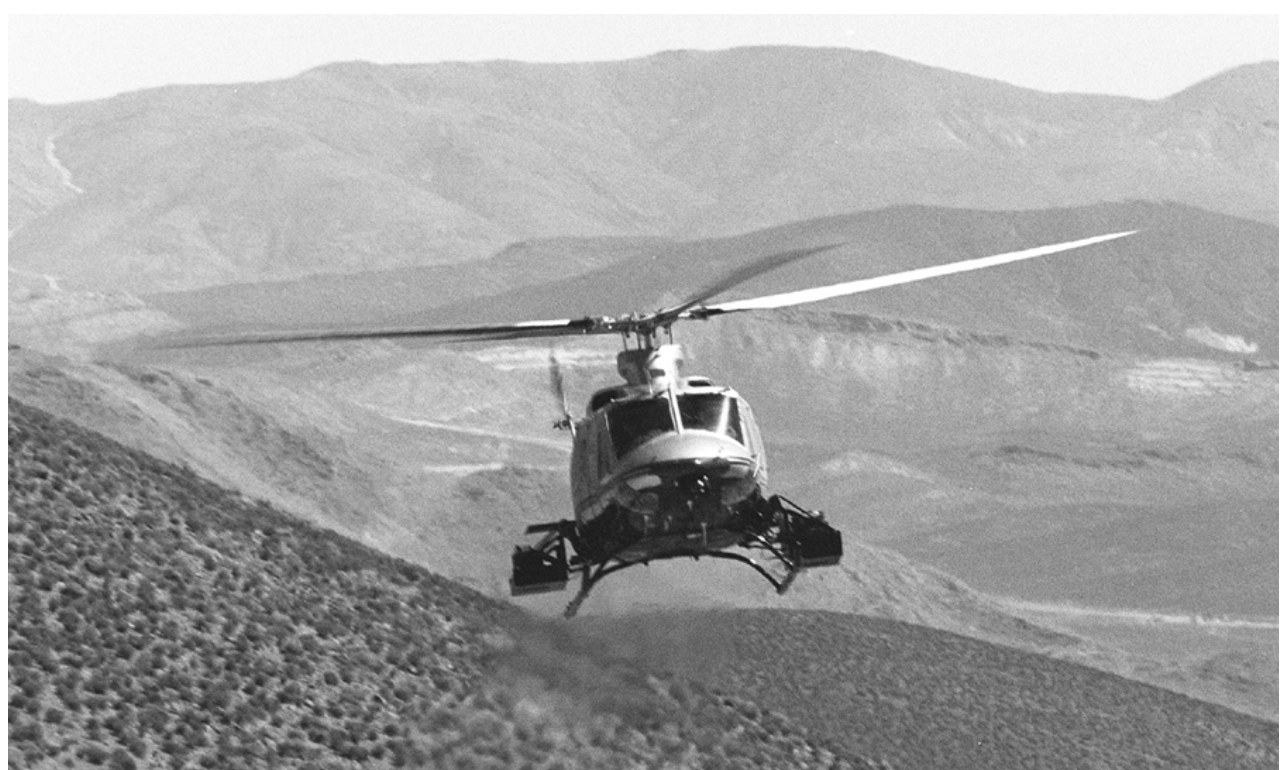
Figure 3: Aerial Measuring System Aircraft With Detection Equipment

Hands-on functions include detecting and evaluating the agent used in the incident; dismantling, transferring, disposing of, and/or decontaminating property; extracting and/or decontaminating victims; performing triage on victims; and providing medical treatment. Some teams perform hands-on functions that are unique from any other federal team. For example, the Department of Health and Human Services' Disaster Mortuary Operational Response Teams are the only federal teams whose primary function is to recover, identify, and process fatalities. These teams can respond to any type of chemical, biological, or radiological/nuclear incident. The Department of Energy's Aerial Measuring System is the only team that can fly aircraft over an incident site to rapidly survey large areas for radiological contamination (see fig. 3).