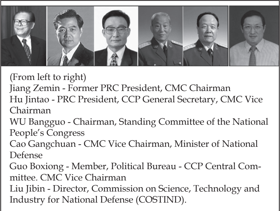
Figure 1. The 998 State Security Project Leading Group.

China's 998 State Security Project has several components that respond to U.S. foreign policy decisions (including decisions to use force) and the development of new military capabilities. 63 The 998 Project calls for the PLA to "... accelerate the research, development and installation of new weapons ... to resist U.S. hegemonism." 64 It is managed under the direction of the Political Bureau of the CCP Central Committee and the Central Military Commission. The 998 Project Leading Group is reported to include the members shown in Figure 1. The work conferences supporting the 998 Project are directed by the four PLA General Staff Departments. 65