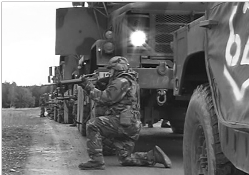
Figure 4: Army Live-Fire Convoy Training Exercise in Germany