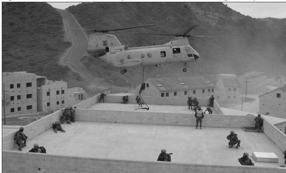
Figure 2: Marines Execute a Helicopter-Borne Raid Exercise Using Flat-Top Roofs