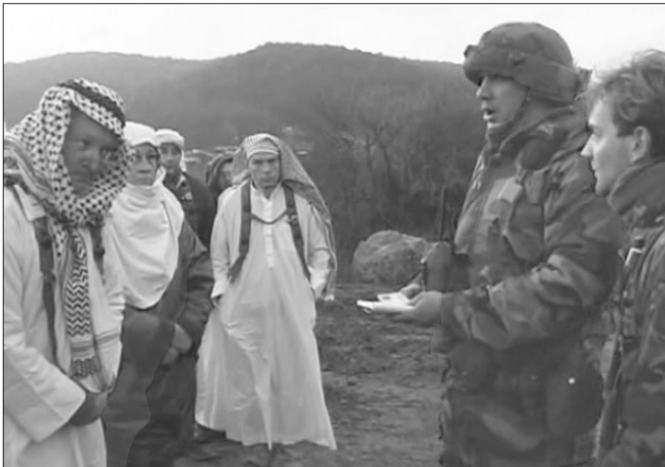
Figure 3: Army Troops Practice Communicating with Role Players as Part of Their Training Exercise in Hohenfels, Germany