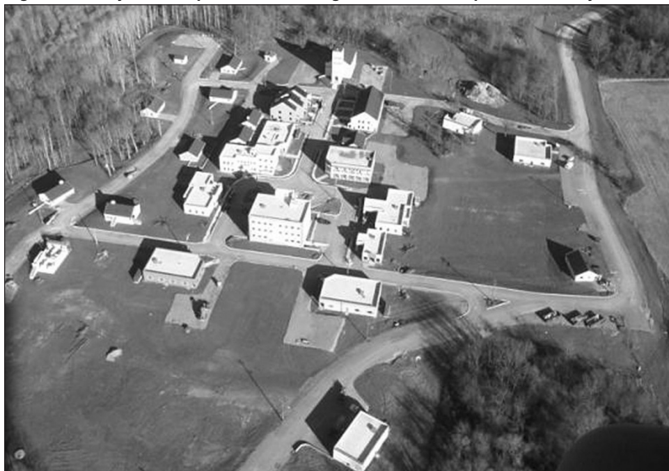
Figure 1: Army Urban Operations Training Site at Fort Campbell, Kentucky