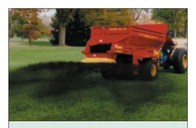
Compost - An On-Par Alternative

The soil on the North Shore Country Club (Glenview, Illinios) golf course had elevated sodium levels—too high to maintain quality turf. Standard procedure called for the installation of a wellto solve this problem, but that solution came with a quarter million dollar price tag. With a little research, North Shore found compost to be the economical alternative to enhance the quality of its soil.