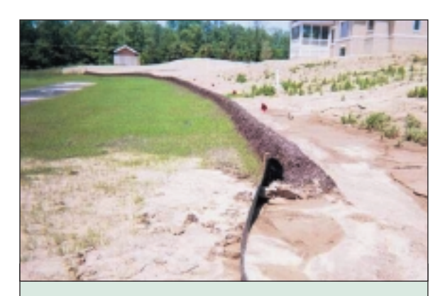
This filter berm made from compost demonstrates how well the organic material helps retain runoff in comparison to a typical silt fence in the lower portion of the photo.