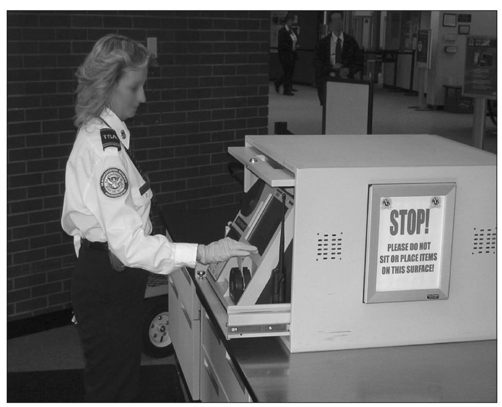
Figure 2: ETD Machine Used by TSA to Screen Checked Baggage