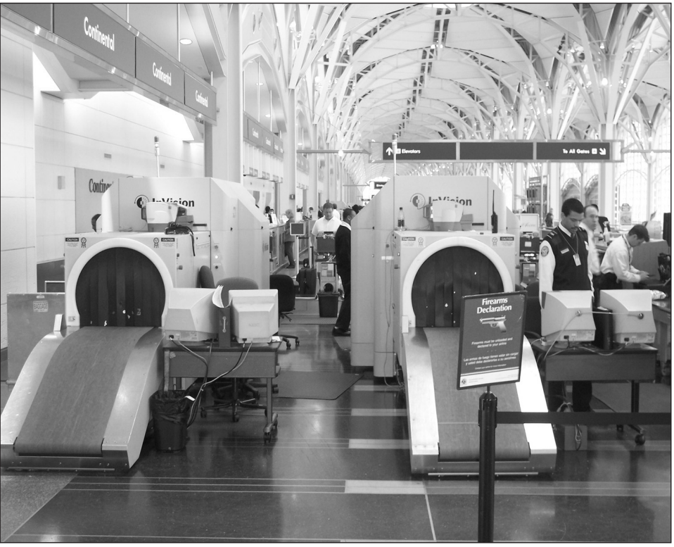
Figure 1: EDS Machines In a Stand-alone Configuration Used by TSA to Screen Checked Baggage