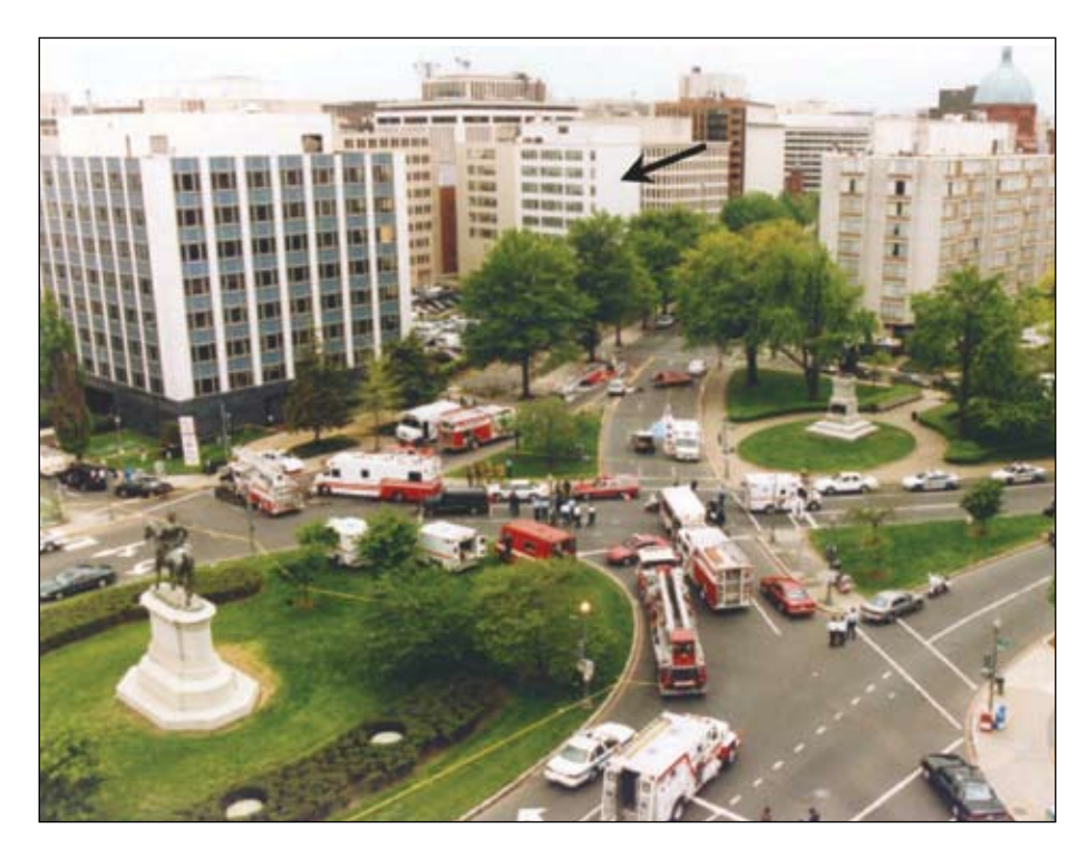
Photo 7. An overview of apparatus placement. The arrow points to the B'nai B'rith Building.