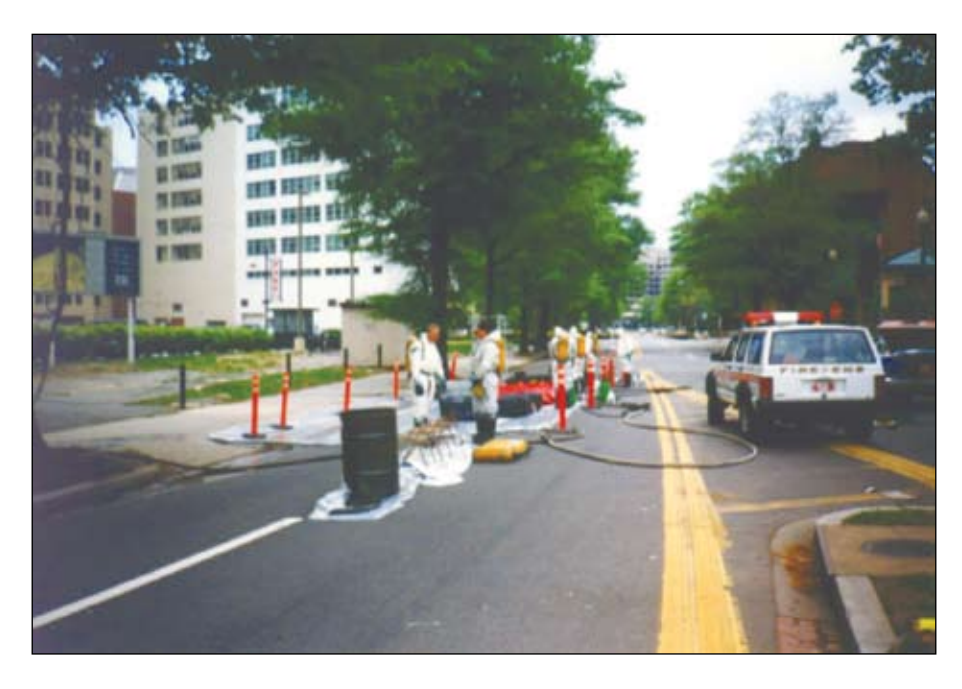
Photo 4. The decon area is set up, consisting of a tool drop station, gross bleach wash, rinse, and a second wash and rinse area.