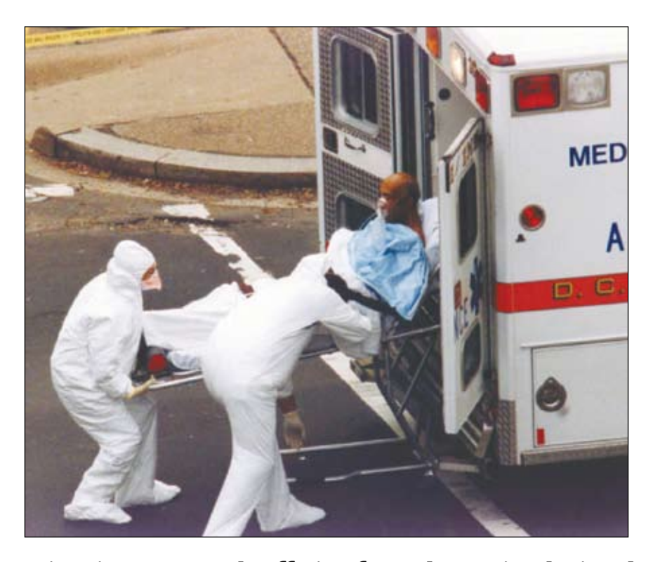
Photo 6. A patient is transported suffering from chest pains during the incident.