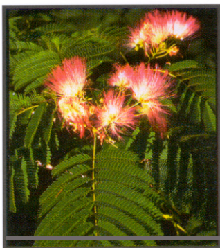
Mimosa flowers & leaves