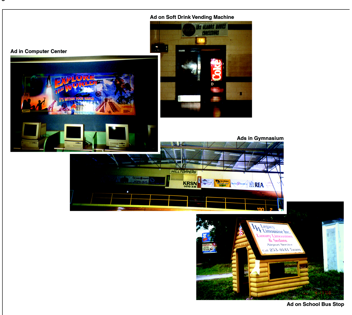
Figure 1: Advertisements Can Be Found in and Around Schools