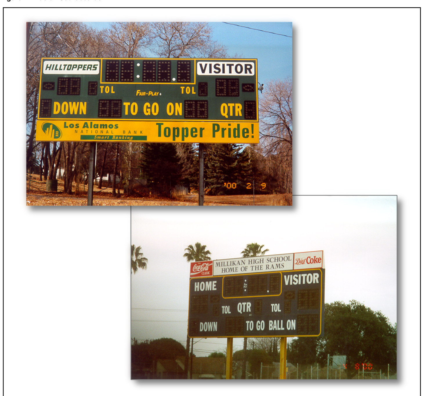
Figure 2: Ads on Scoreboards