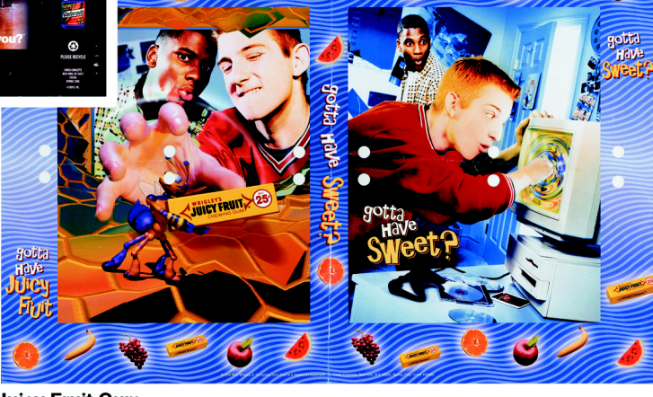
Juicy Fruit Gum