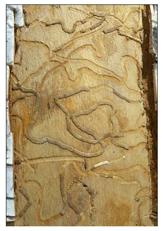
Figure 5. Meandering or zigzag galleries formed under the bark by tunneling larvae.