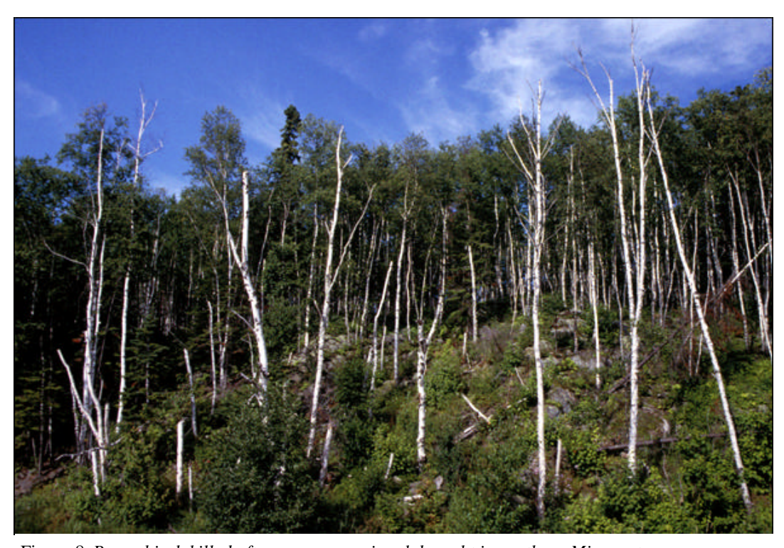
Figure 8. Paper birch killed after a severe regional drought in northern Minnesota.

Bronze birch borers infested and ultimately killed many of these trees (figure 8). A massive dieoff of birch was observed throughout the Great Lakes region in the early 1990's indicating that many of the existing birch-dominated ecosystems throughout the region were aging and more likely to be stressed by weather events. Developing a mosaic of age classes should reduce bronze birch borer impact over a large area and contribute to the stability of the birch resource within that region.