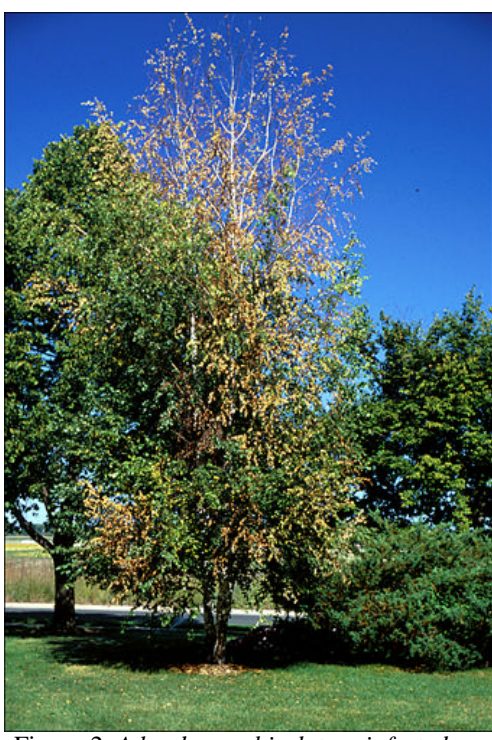
Figure 2. A landscape birch tree infested with bronze birch borers. Branches in the upper canopy are usually affected first.

The condition of host trees is the principal factor in the birch tree and borer relationship. Adult bronze birch borers primarily attack birches that are weakened or stressed by drought, old age, insect defoliation, soil compaction, or a stem or root injury. Birch trees prefer cool, moist growing locations and have a shallow root system that is easily injured by disturbance or dry, hot conditions. Many landscape birch trees are planted in unsuitable habitats and are stressed on a regular basis. Birch trees growing within a forest are stressed by old age, weather events such as drought, or by repeated defoliation. Widespread birch mortality often occurs after these events.