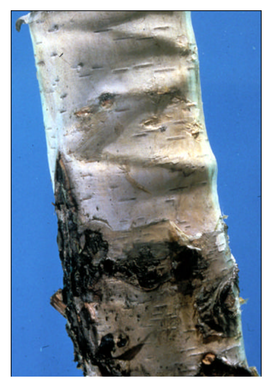
Figure 3. Swellings or bumps formed where a tree has healed over a gallery of the bronze birch borer.