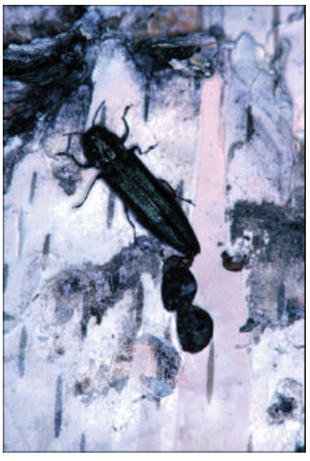
Figure 1. Bronze birch borer adult and two D-shaped exit holes.

Bronze birch borers are known to attack all native and introduced birch species, although birch susceptibility varies. Many varieties of birch species as well as numerous crosses between species are currently planted as ornamentals in North America. Although some varieties are more resistant than others.