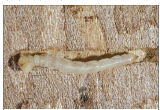
Figure 6. Larva of the bronze birch borer .

Adults emerge from previously infested trees between early May and early June in the southern part of the borer's range and from late June to mid-July further north. Adults in any one location may emerge over a 5 to 6-week period. Adult beetles live about 3 weeks. Therefore, adults may be found on trees during most of the summer.