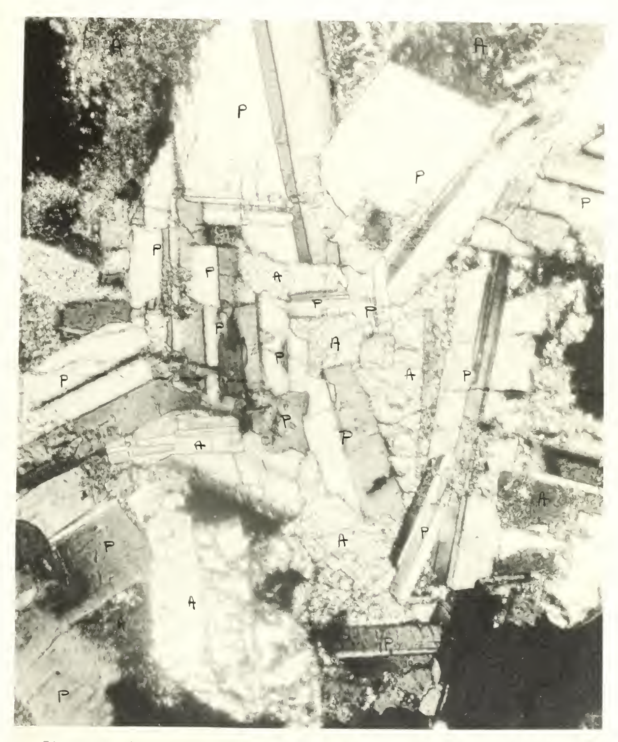
Figure 2. Photomicrograph of New York Diabase (+00X) (Crossed New 1 Showing Plagioclase Feldspar (P); Altered Pyroxen (1), no Quartz Observed.