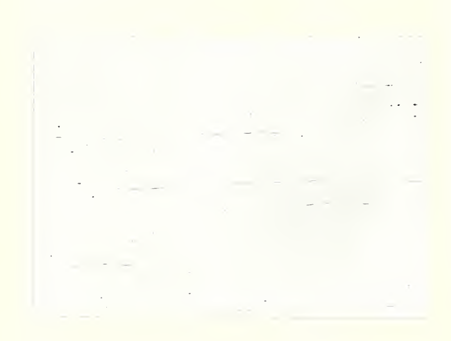
Figure 1. Thin inclusions, probably manganese sulfide, found in longitudinal section of plate sample No. 604. Unetched. X 100.