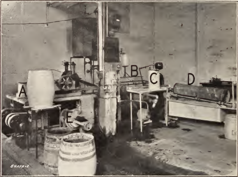
FIGURE 2.— Pulping and screening equipment. A, Beater; B, screen; C, purifier; D, concentrator; E, jordan.