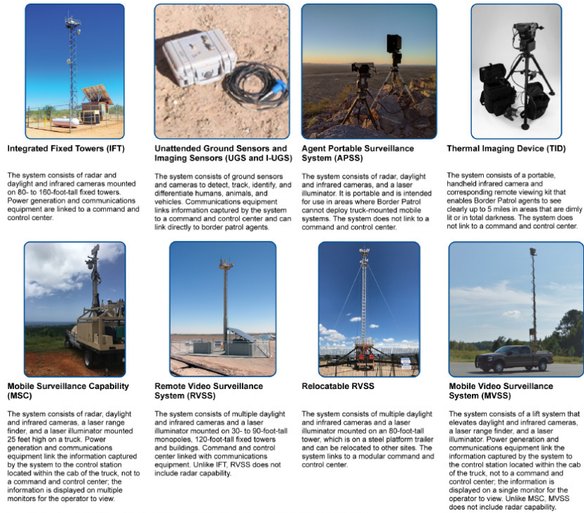
FIGURE 1: BORDER SURVEILLANCE TECHNOLOGY SYSTEMS USED BY THE BORDER PATROL

Source: GAO analysis of U.S. Customs and Border Protection (CBP) information; CBP (photos); GAO (photos) | GAO-18-397T