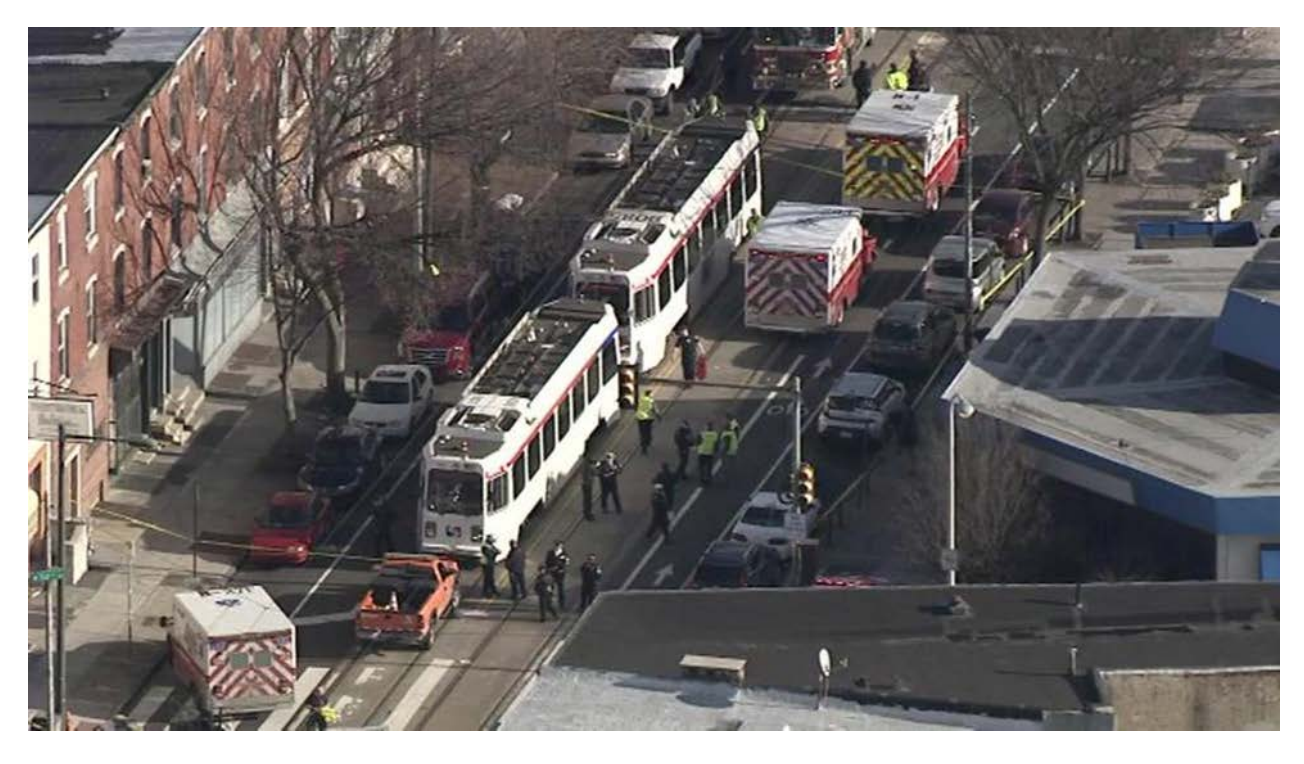
Figure 1. Overhead view of the accident scene.

On January 4, 2017, at 12:47 p.m. eastern standard time, Southeastern Pennsylvania Transportation Authority (SEPTA) trolley 9101 (struck trolley), traveling northwest on trolley route 10 with an estimated 47 passengers on board, stopped near the intersection of Lancaster Avenue and 38th Street, in Philadelphia, Pennsylvania, to offload passengers.<sup>1</sup> SEPTA trolley 9085 (striking trolley), with 6 passengers on board, was also traveling northwest on trolley route 10, and struck stopped SEPTA trolley 9101 in the rear at an estimated impact speed of 10 mph. First responders transported 40 passengers and both operators to local hospitals for treatment of minor injuries. The total estimated equipment damage to both trolleys was $60,000. At the time of the accident, the sky was partly cloudy, visibility was 10 miles, and the temperature was 54°F. Figure 1 shows the accident scene.