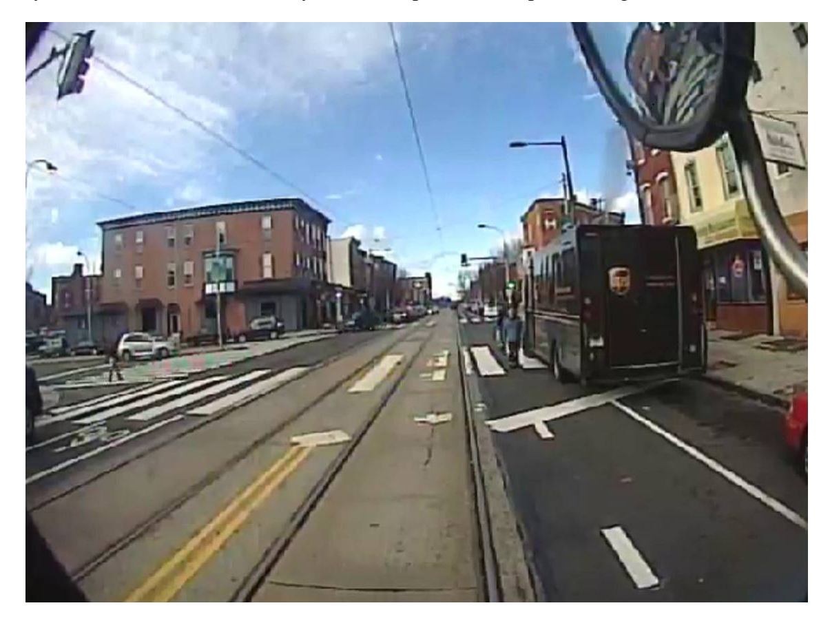
Figure 3. The view from the struck trolley's forward-facing camera, 2 seconds before impact.

The operator of the striking trolley told NTSB investigators that it was at this point that he began to feel groggy. He said that he blinked his eyes and saw trolley 9101, that was stopped behind a delivery truck, immediately in front of him. Although he slammed on his foot brake, trolley 9085 struck the rear of trolley 9101 at a speed of 10 mph. (See figure 3.)