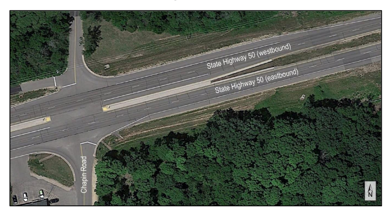
Figure 2. Aerial view of State Highway 50 where pedestrian, walking east on roadway, was struck by SUV. Intersection with Chapin Road is shown west of crash site.

The highway has no sidewalks. A single streetlight stands at the northwest corner of the intersection, about 180 feet from the area of impact. A National Transportation Safety Board (NTSB) investigator visited the crash location a week after the crash, at 1:25 a.m. on August 23, 2016, to observe the area under ambient lighting alone. The skies were dark and the moon was 31.1° above the horizon, as on the night of the crash. Less of the moon's surface was illuminated (71 percent), meaning that the surroundings were darker. Nevertheless, the investigator could clearly discern the grass shoulder, paved shoulder, travel lanes, and median.