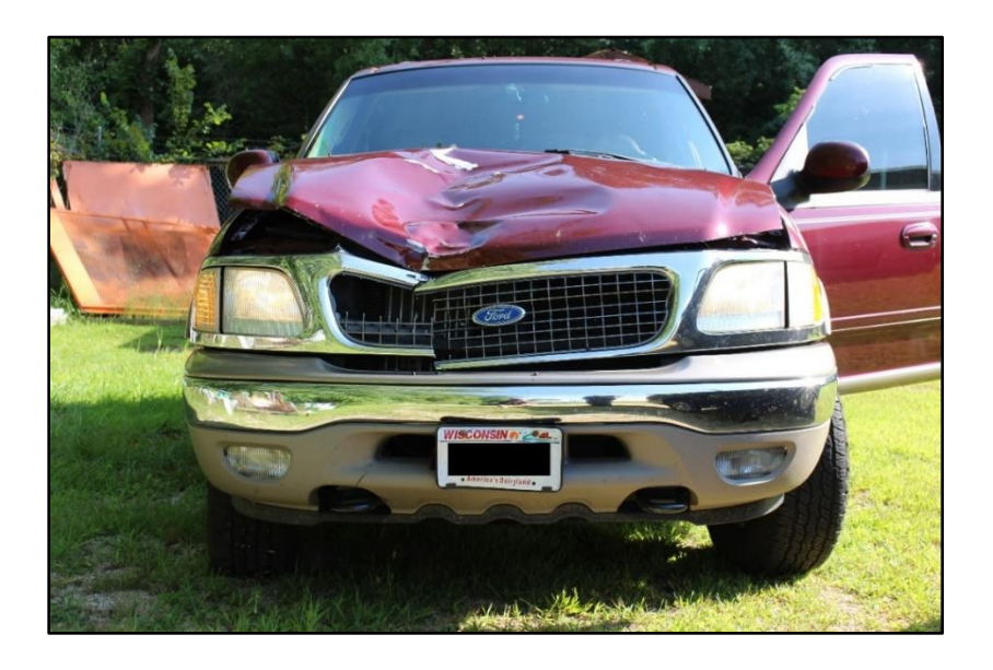
Figure 3. Front of SUV showing contact damage to hood, grille, and bumper.

The 2001 Ford Expedition four-door SUV was examined at the Town of Geneva Police Department's impound facility. The SUV's air bags for the driver and front passenger did not deploy in the collision. Contact damage to the front of the SUV was concentrated in an area slightly offset toward the passenger side from the vehicle's centerline (figure 3). Contact damage was noted on the vehicle's front bumper, grille, hood, and roof. The most significant damage was to the hood. The driver stated that the vehicle had no mechanical problems before the crash.